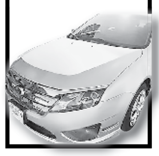
10. Business Services