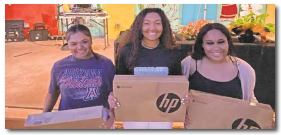
These three young ladies were awarded laptop computers.

The Superior Optimist Club has awarded over 60 laptop computers. The club raises money through out the year to host this event and give these awards. To learn more about the Superior Optimist Club you can attend one of their monthly meetings. They meet the first and third Tuesdays of each month at 6:30 p.m. at the Superior Chamber of Commerce office, 165 Main Street.