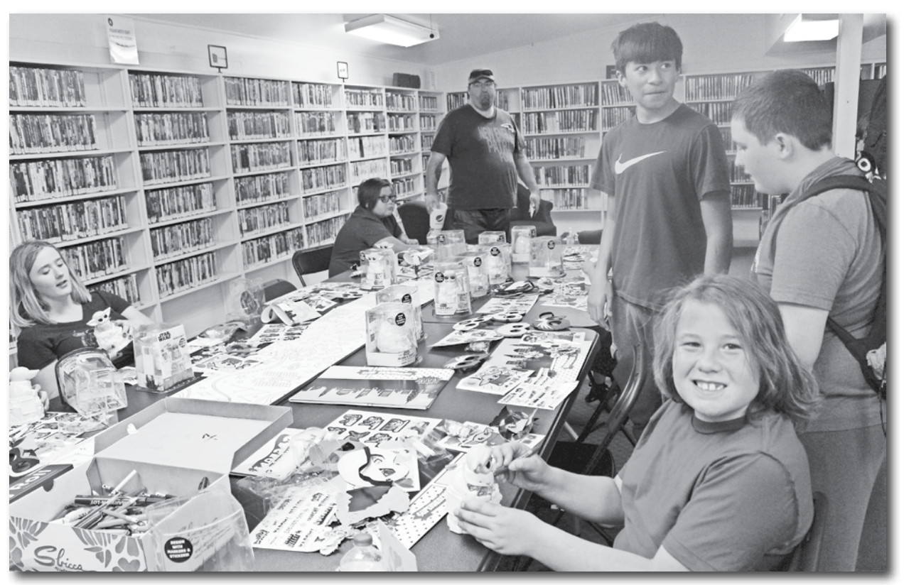
Having some fun at the San Manuel Library on Star Wars day.

Securities and investment advisory services offered through Woodbury Financial Services, Inc. (WFS) member FINRA/SIPC. WFS is separately owned and other entities and/or marketing names, products or services referenced here are independent of WFS. Insurance is offered through Arizona Financial Services