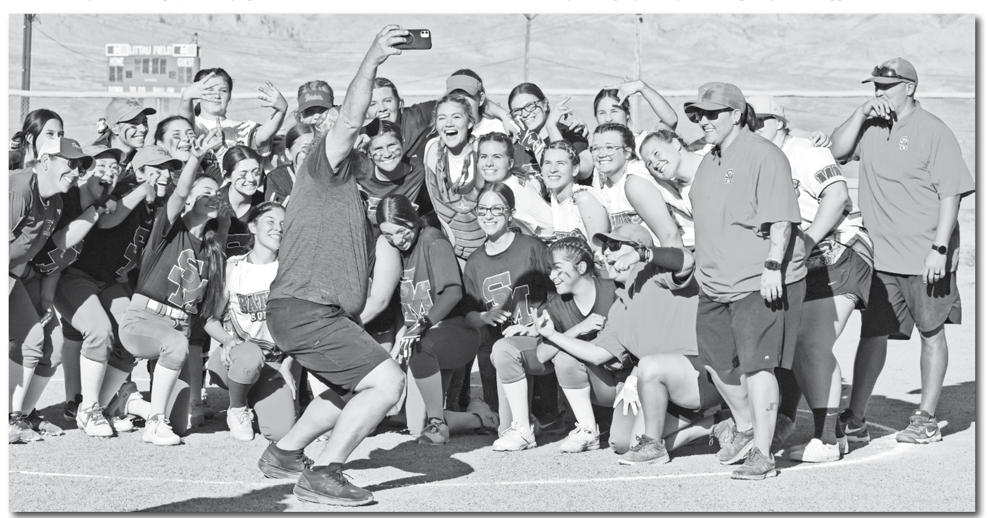
San Manuel and Mojave Accelerated teams take a selfie after San Manuel's win in quarter finals.

The girls will travel to the Fiesta Sports Complex on May 12 to compete against Bagdad in the 1A State Semifinals. The game is set for a start time of 5 p.m. If you are not able to support the Lady Miners in person, consider buying a ticket to the online livestream of the game at https://gofan.co/app/events/602888.