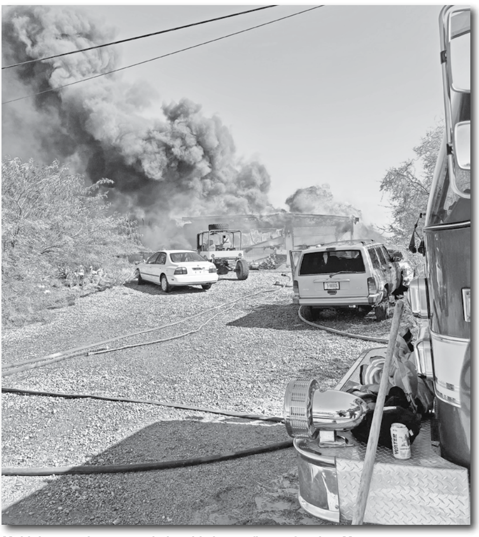
Multiple agencies responded to this house fire on Sunday, May 8.