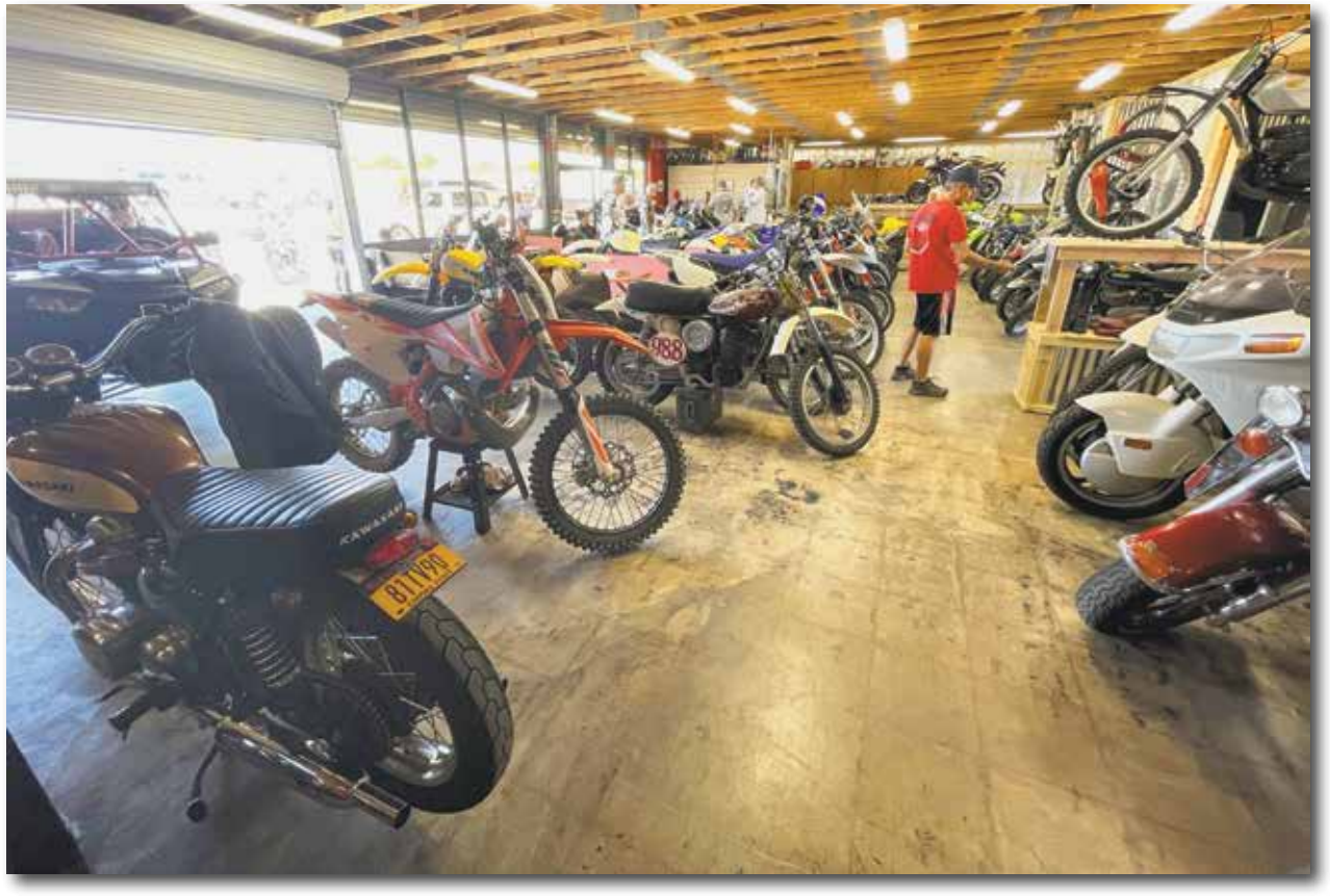
Checking out the motorcycles at JWJ Cycles.