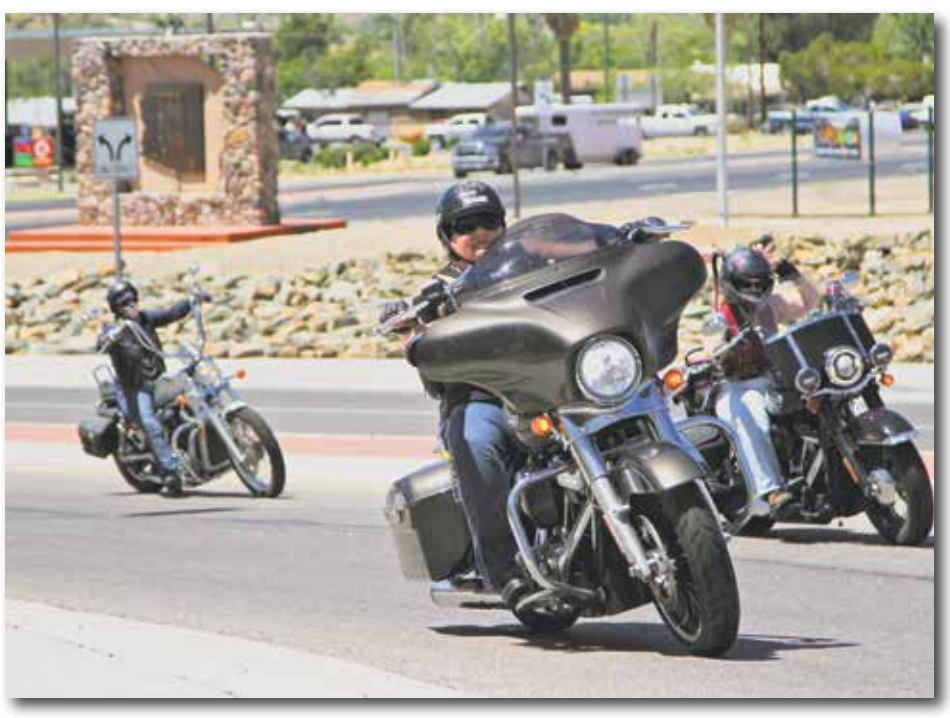
Riders driving to Main Street.

Congratulations, Lady Panthers, on a well played season!