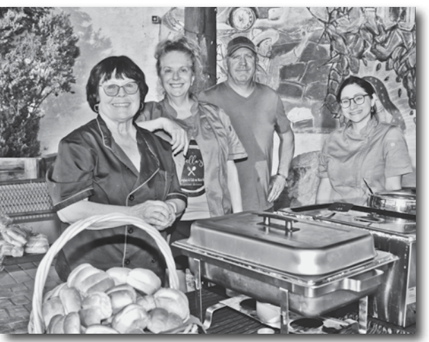
Dinner provided by Bella's Marketplace and Cafe