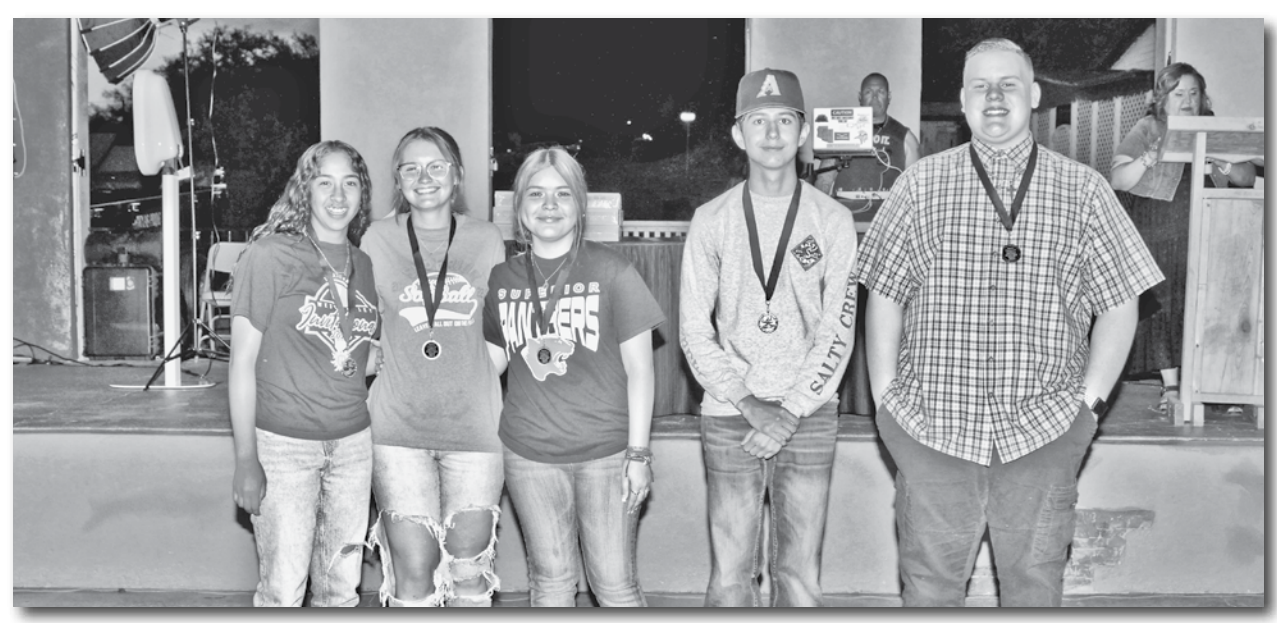
Bronze Award winners.

Congratulations to all the students on your hard work.