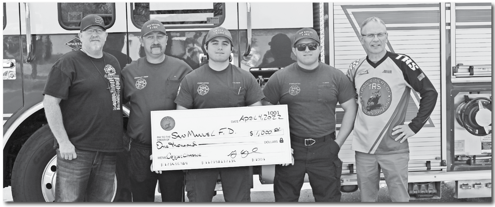
Trail Riders of Southern Arizona presented donation checks to the San Manuel Fire Department (above) and the Mammoth-San Manuel Community Schools (below).