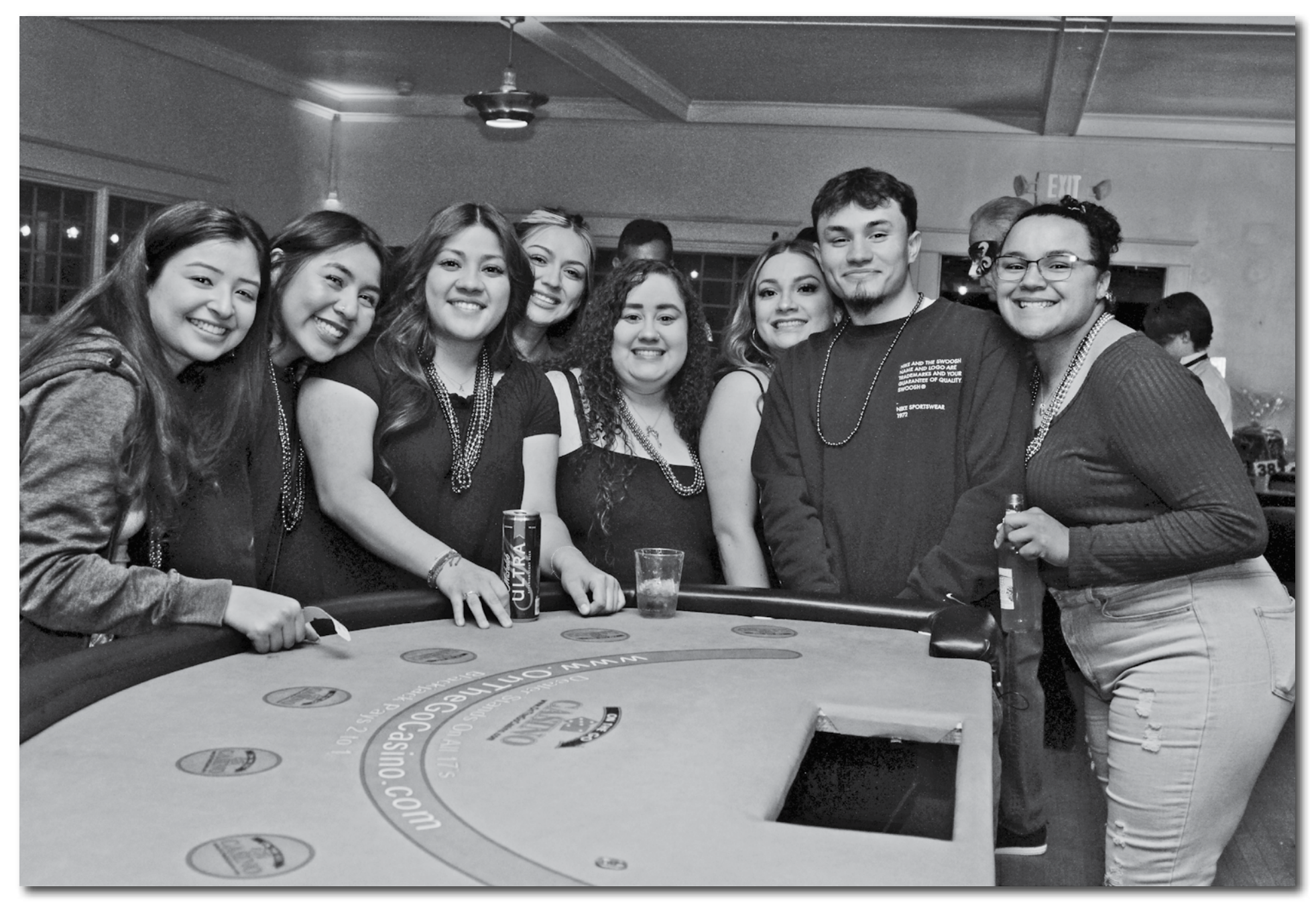
Folks have some Mardi Gras fun at the Magma Royale event by Superior Optimist Club.