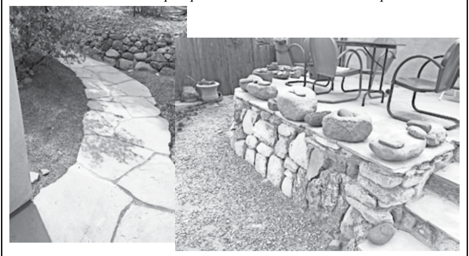
Projects include: Biosphere 2 · Catalina Scenic Highway: Windy Point / Seven Cataracts / Aspen View Coronado National Forest: Sabino, Molina & Madera Canyon / Prison Camp Historic Monument Numerous Oracle Patios