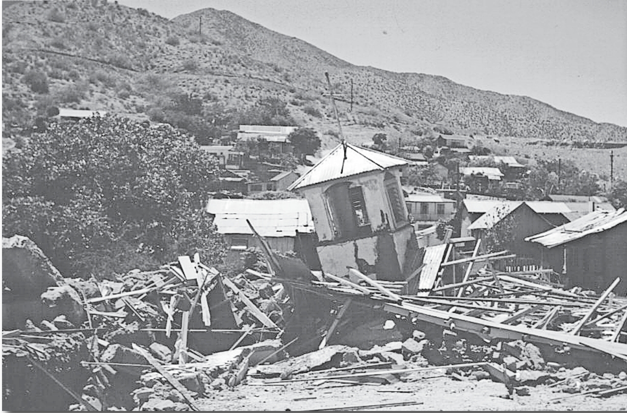
Demolition of the St. Helen's Church not moved to the new site in Kearny.

How the St. Helen's Catholic Church building, once located in the now defunct town of Sonora, Arizona, became Infant Jesus of Prague Catholic Church in Kearny is a unique story – a story both sad and happy.