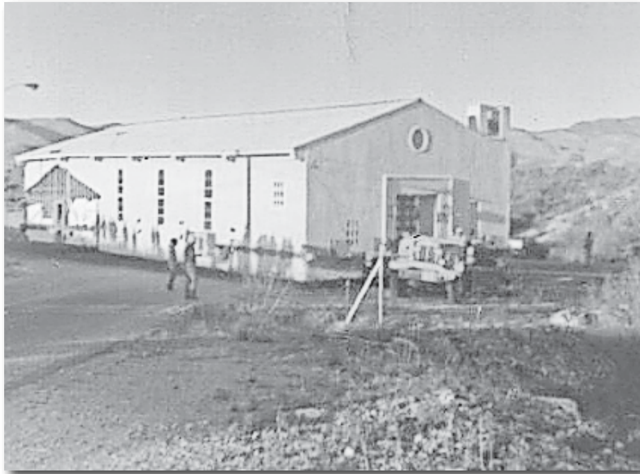
Infant Jesus of Prague Church after the move.