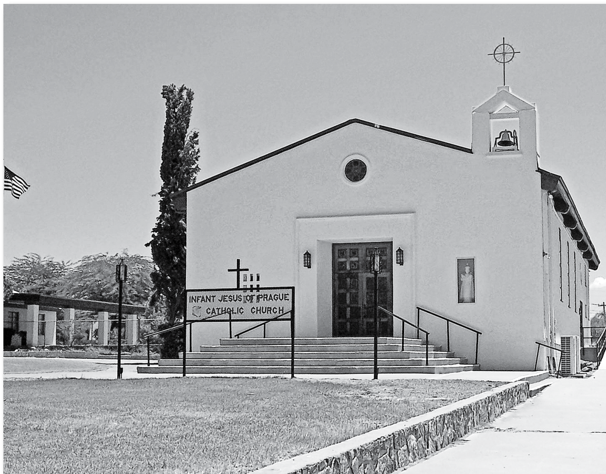
Infant Jesus of Prague Catholic Church, c. 2010.