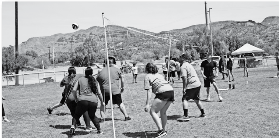
Co-Ed Volleyball drew several players.