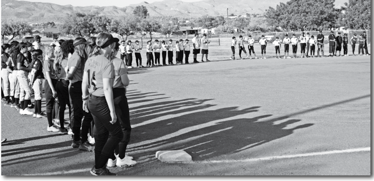
These Kearny Little league players are ready to play ball. The opening ceremony was held Monday. Each player was introduced along with the coaches. Coaches gave each team member a high five before entering the field.