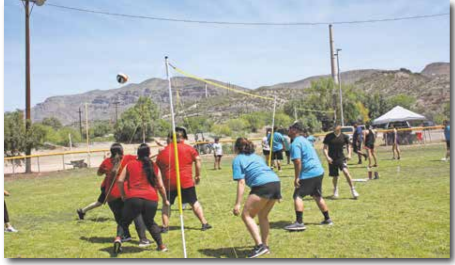
Co-Ed Volleyball drew several players.