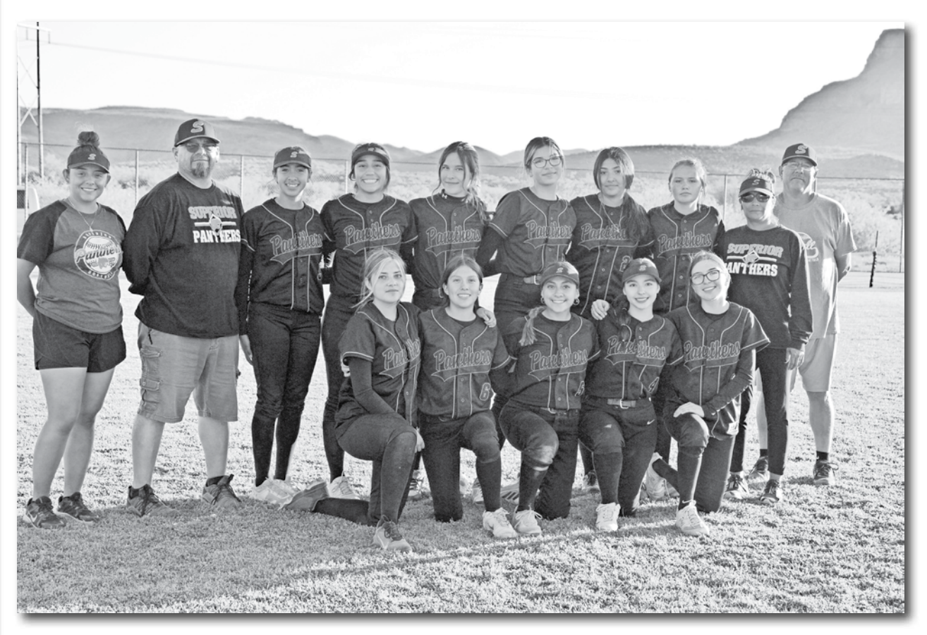
The 2023 Superior Lady Panthers.