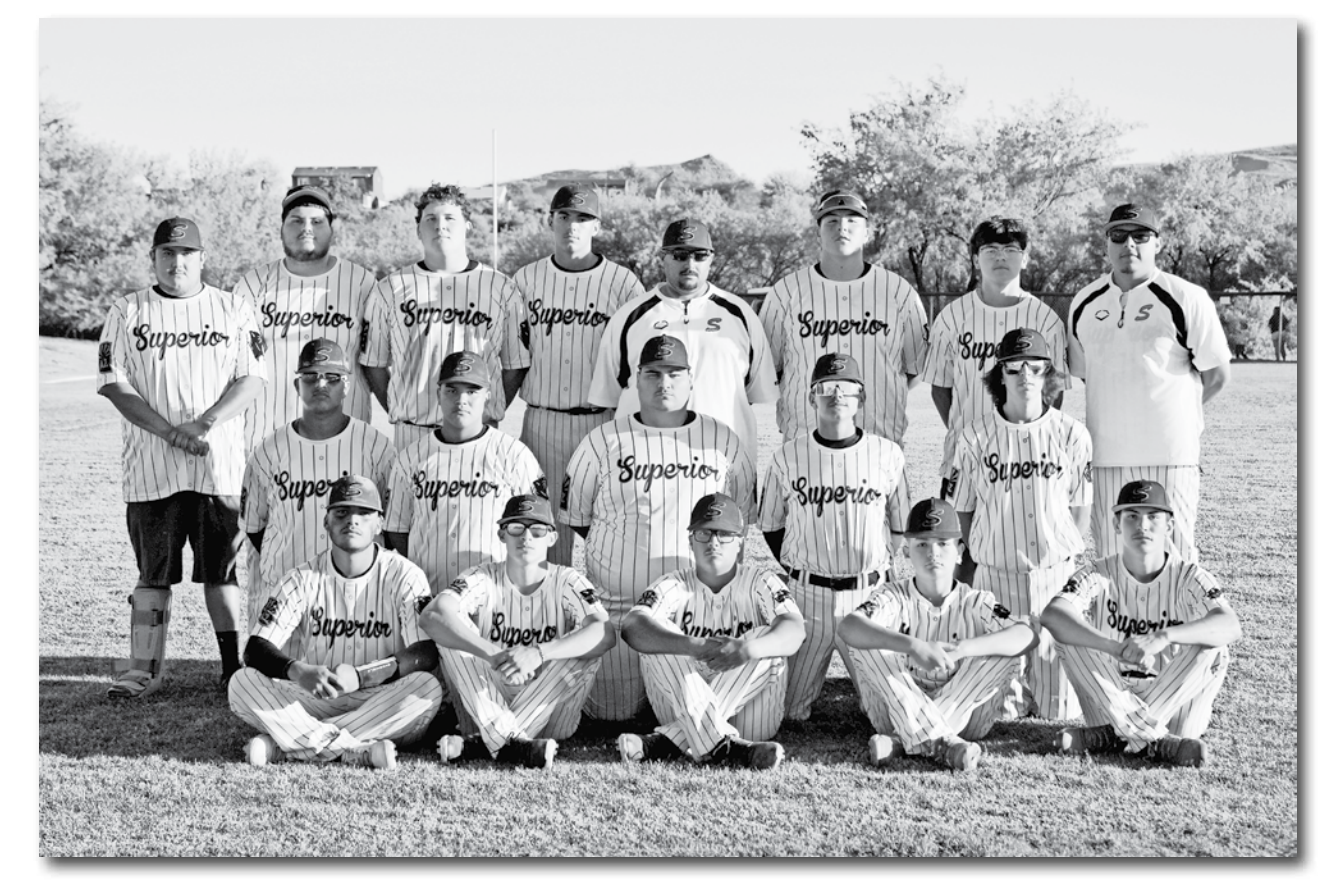
The 2023 Superior Panthers.