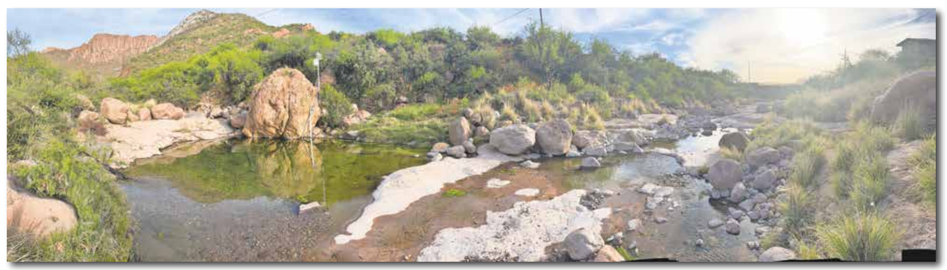
Flowing water in Queen Creek as a result of the limited discharge test occurring this month in Superior, AZ.