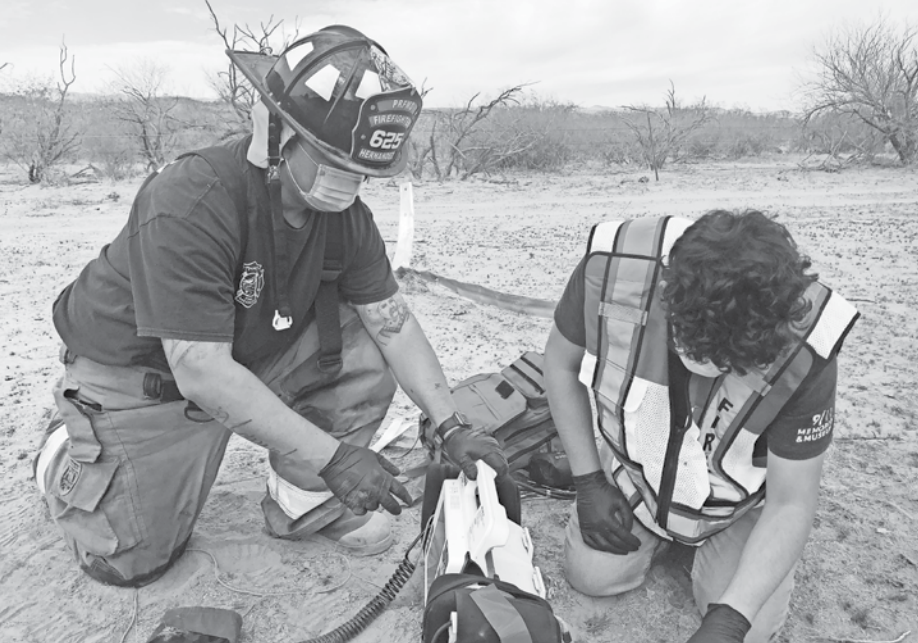
First responders ready the equipment to rescue the driver of the vehicle that rolled in a crash Friday near Mammoth.