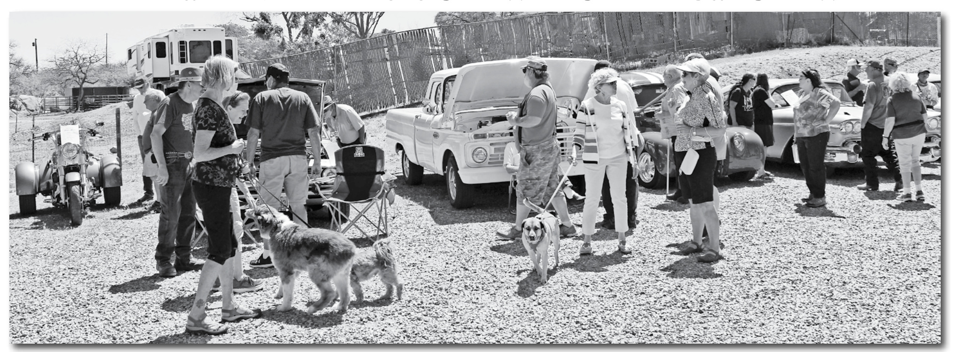
A large crowd showed up at the Oracle Assembly of God Church for the Show-n-Shine Car Show on Saturday April 17. The show featured some vintage, antique, classic and custom cars, trucks, motorcycles and even a few tractors. Everyone enjoyed being out in the nice weather, meeting with friends, talking with the vehicle owners, good food and fun.