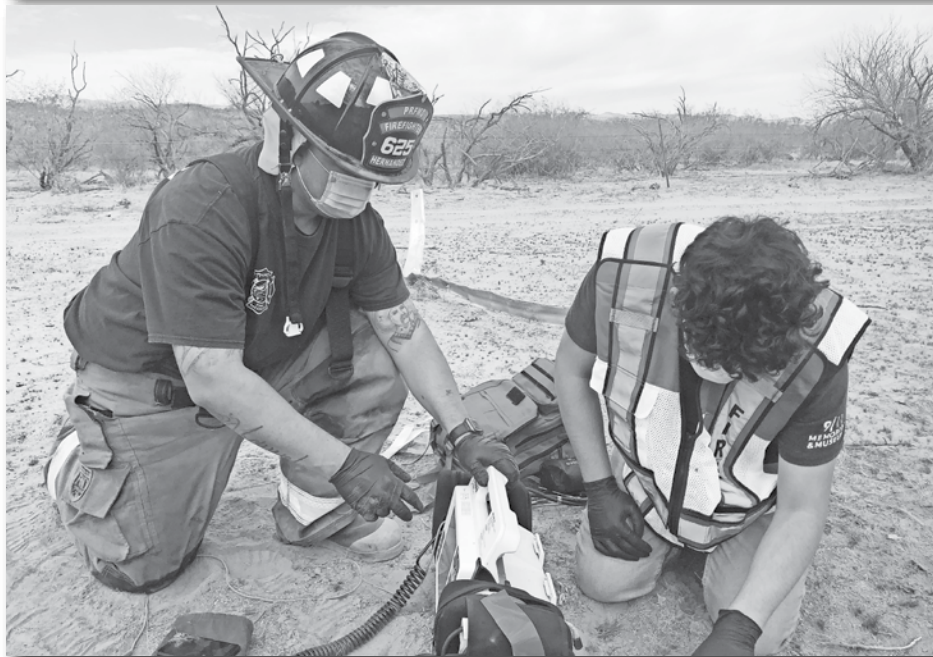
First responders ready the equipment to rescue the driver of the vehicle that rolled in a crash Friday near Mammoth.

One person was transported to a Tucson trauma center Friday after a rollover accident sent the vehicle plunging over an embankment near the San Pedro River.