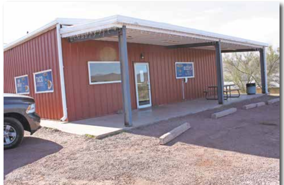
Buzzy's has been in business for 65 years.