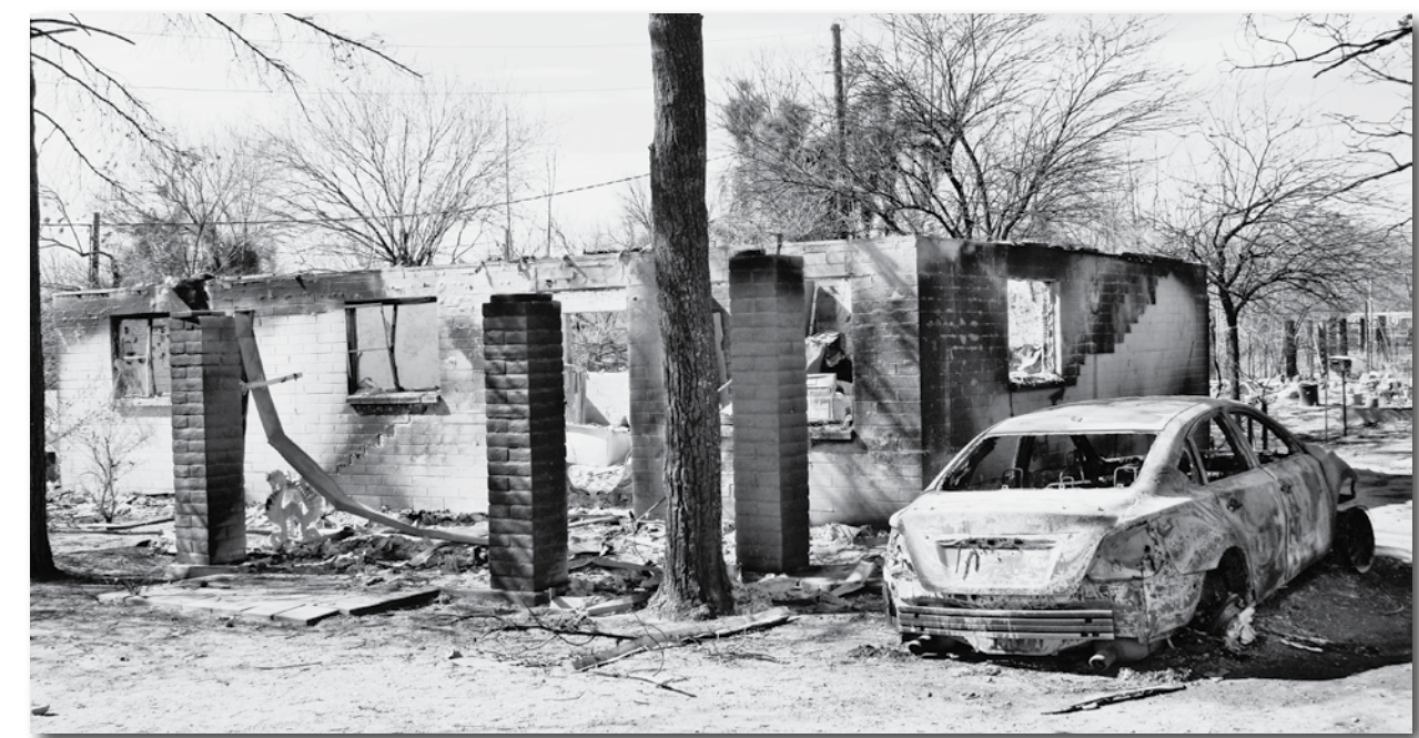
Twelve structures were lost in the fire as was this vehicle.

playing horseshoes is not for you, then consider purchasing raffle tickets. Organizers want to remind everyone that there will be no outside food or beverages allowed. Estillo Sonora taco food