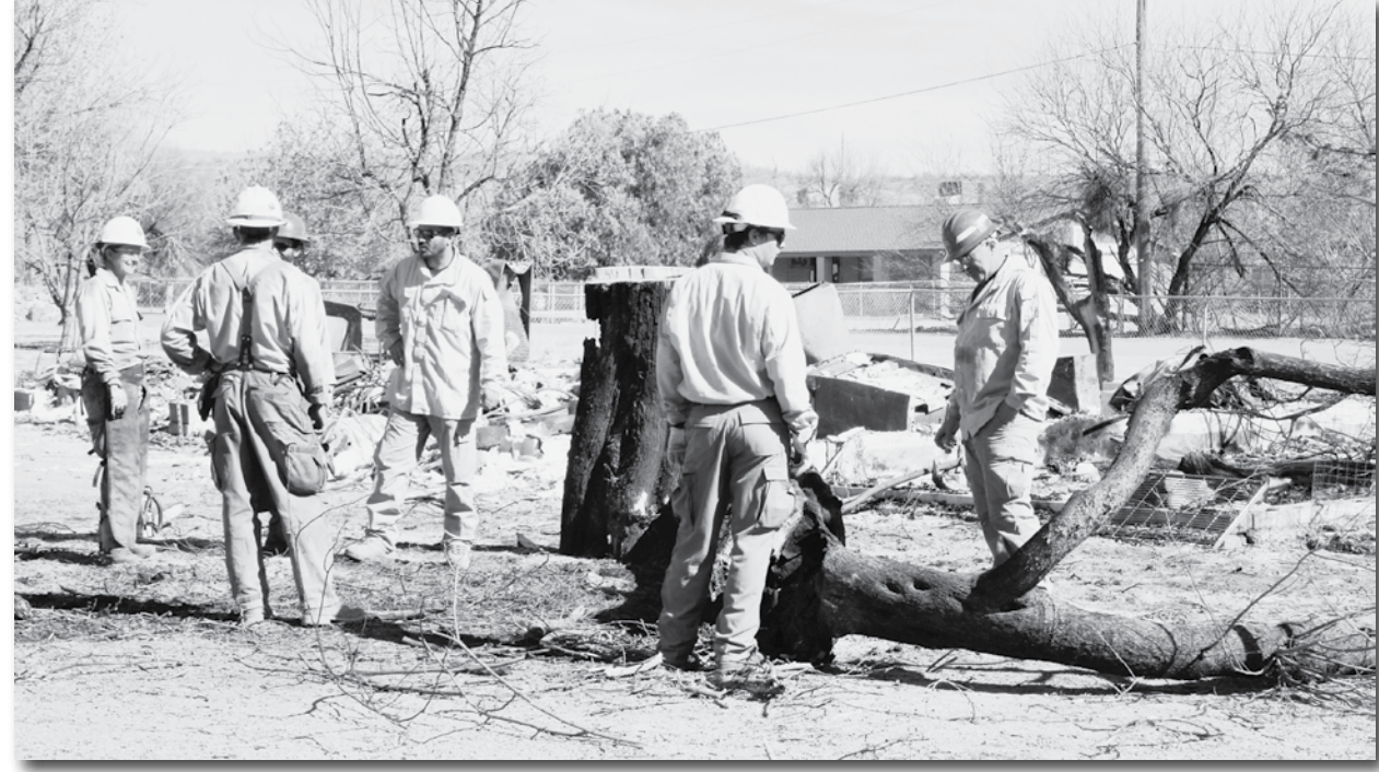
Fire crews were still busy Sunday afternoon cleaning up.