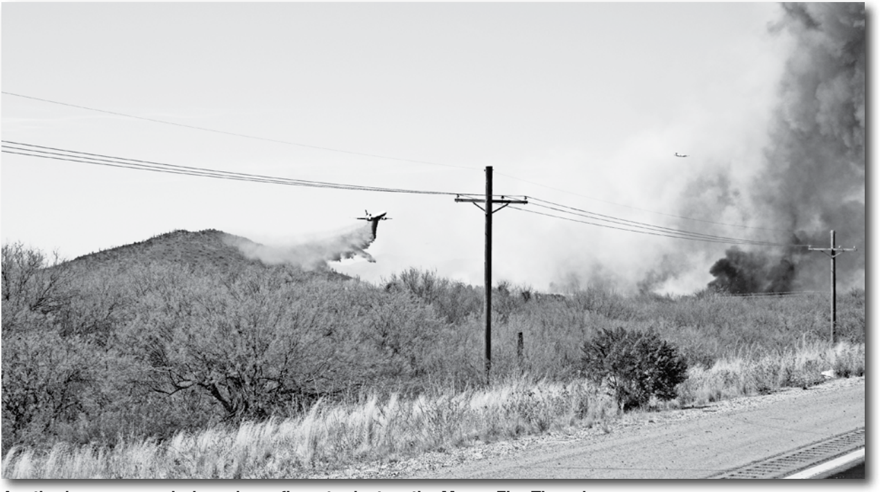
A retired passenger airplane drops fire retardant on the Margo Fire Thursday.

Email: jenniferc@MinerSunBasin.com; Miner@MinerSunBasin.com; michaelc@MinerSunBasin.com