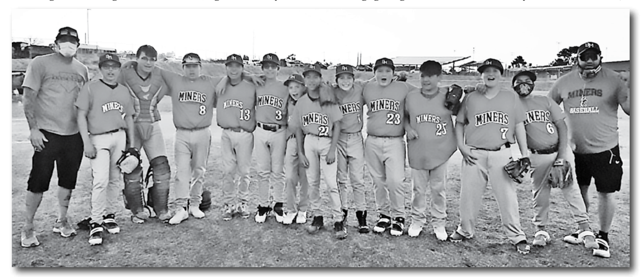
The high school baseball team isn't the only one having some success. On Monday, the San Manuel Junior Miners posted a 15-14 win over Eloy. Congratulations, Jr. Miners!

Union, the girls picked up the pace, and played an intense game. By the end of the third inning it was 12-0. The fourth inning was concluded with an additional 11 points being added to the board. The game ended after the fifth inning, giving San Manuel the victory, the final score 23-0.