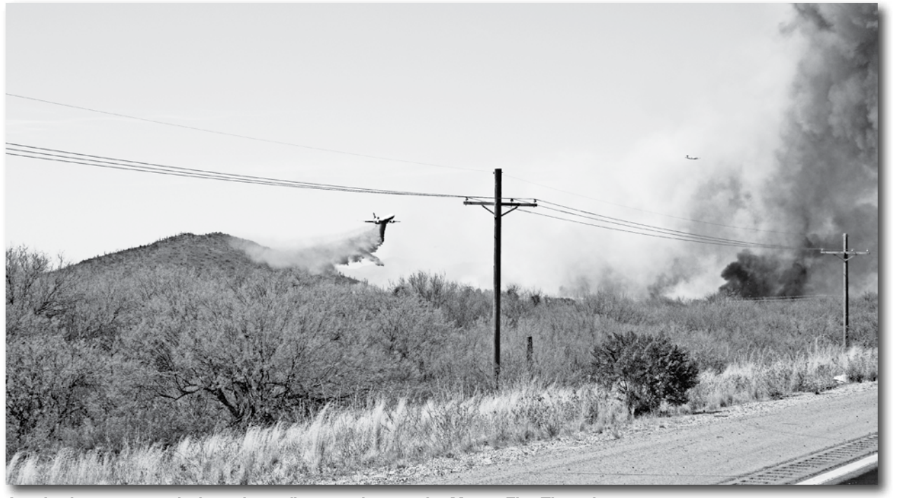
A retired passenger airplane drops fire retardant on the Margo Fire Thursday.

Obituaries are published free of charge in the San Manuel Miner. If you have an obituary you would like us to print, please email it to: cbnsun@minersunbasin.com or submit it online at copperarea.com. You can also request our newspaper through the funeral home.