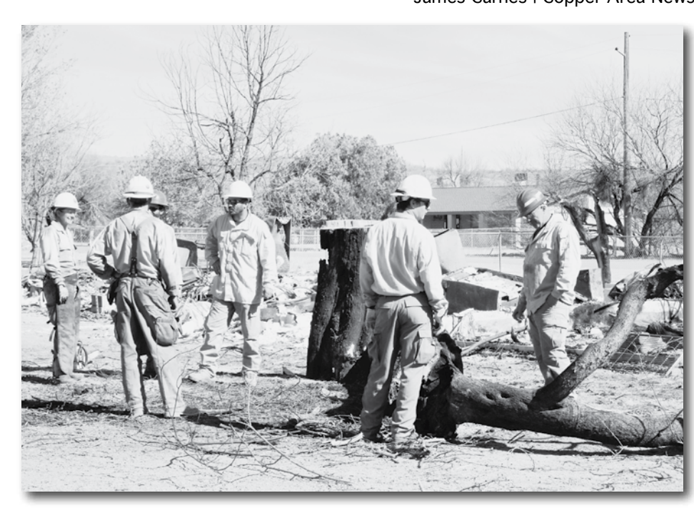
Fire crews were still busy Sunday afternoon cleaning up.