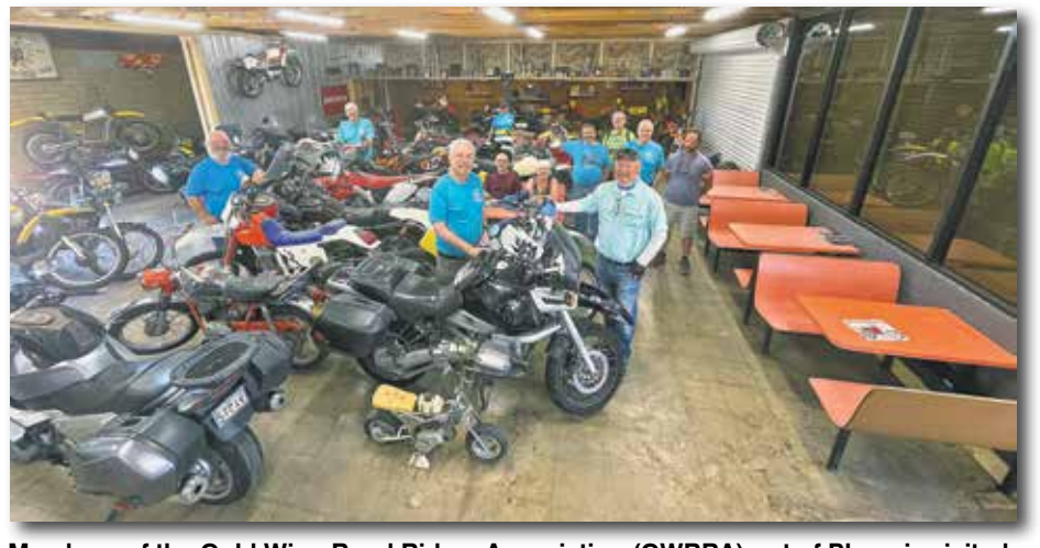
Members of the Gold Wing Road Riders Association (GWRRA) out of Phoenix visited JWJ Cycles in San Manuel.