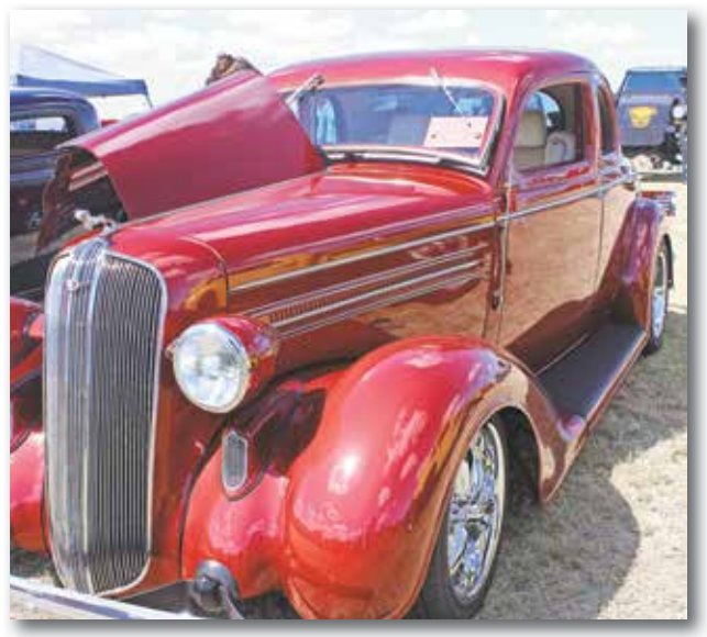
Best Interior, Red 1936 Dodge Coupe - Troy Rupp (Marana)