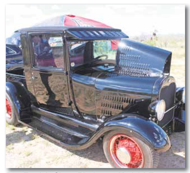
Best Truck in Show, Black 1928 Model A Truck -Don McDowell (Tucson)