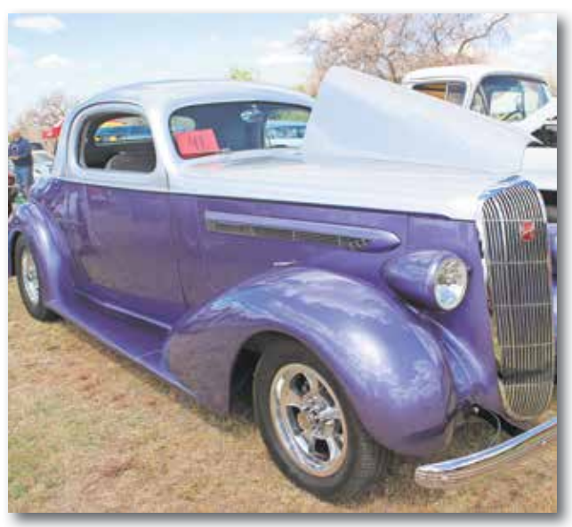
Best Car in Show, Silver/Purple 1936 Buick Coupe - Patricia Dudzic (Tucson)