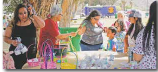
Youngsters were given baskets and other goodies for the egg hunt.

The Easter Bunny was there to visit the kids.