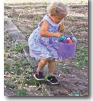
After the winds calmed a little, kids were able to find plenty of eggs. It was reported that during the sudden high wind the jumping castle was also blown over with a child inside. No information was received about any injuries.