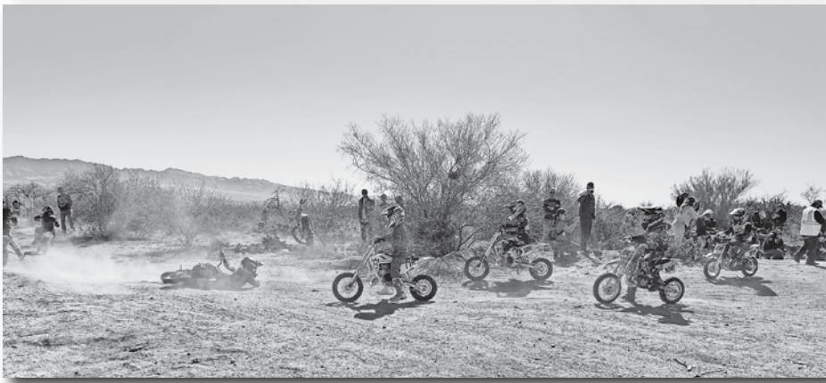
Racers ride the course through the desert near Gardner Middle School in the 16th annual Copper Classic.