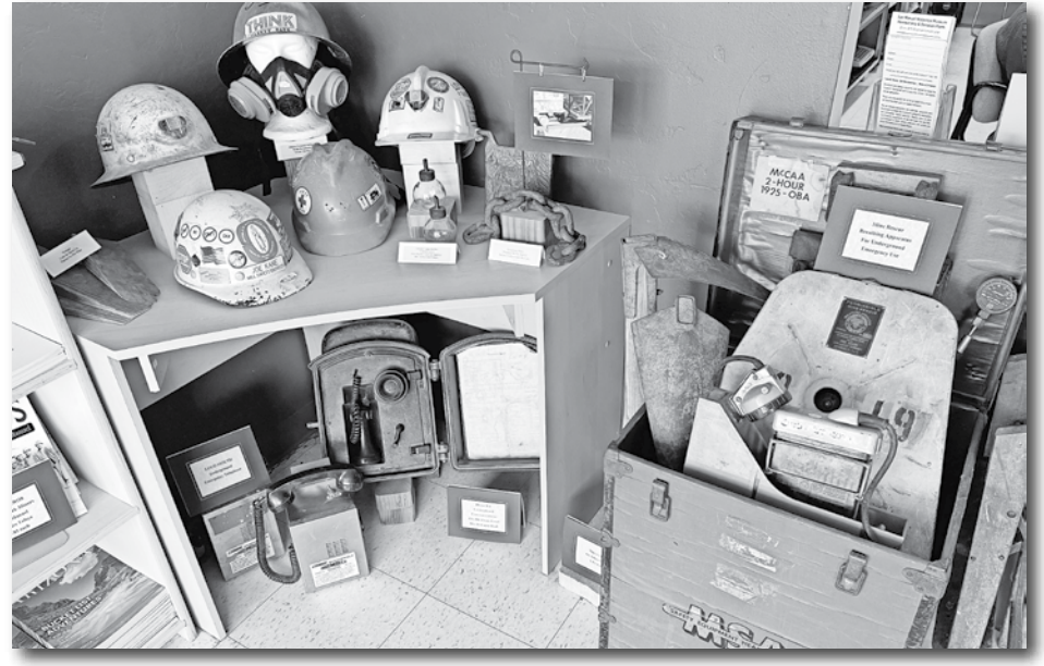
Have you visited the San Manuel Historical Society's museum? Check out some of the items exhibited at the museum.