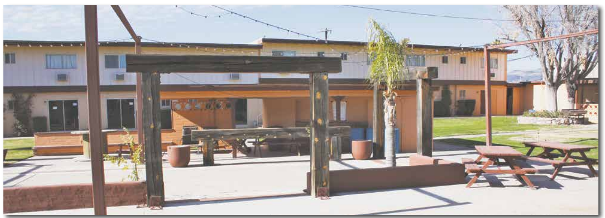
The beautiful courtyard at the General Kearny Inn offers a perfect outdoor venue.