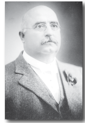
Gov. G.W.P. Hunt