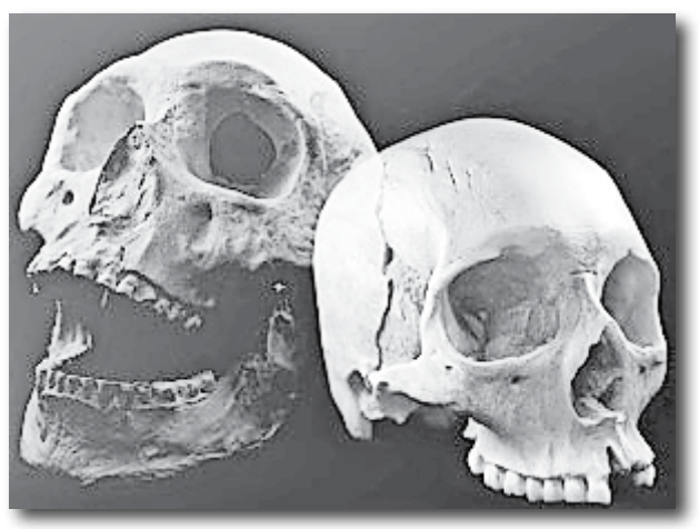
Why did the prison warden need the skulls from two executed prisoners?