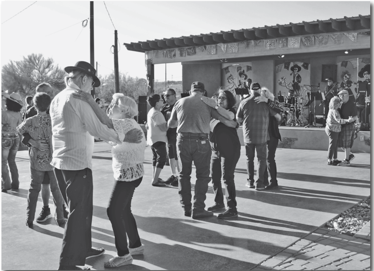
It was a beautiful spring afternoon for a community Tardeada.