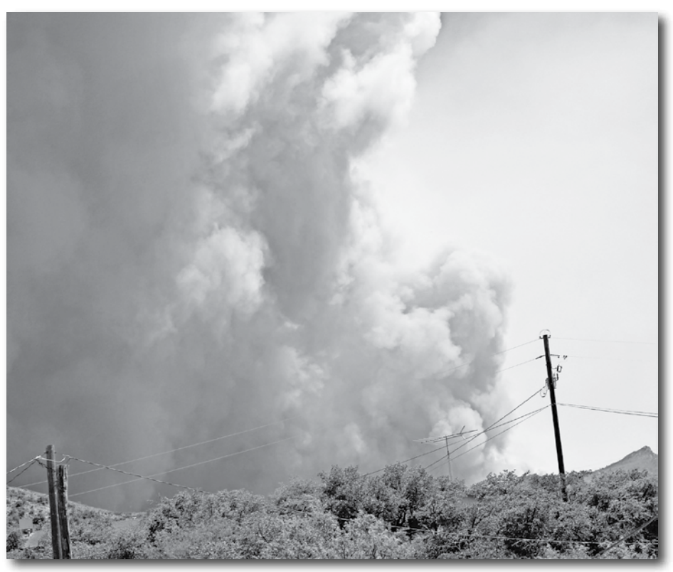
Oracle Fire District wants to help residents prepare for wildfire season. A grant they received will open the brush dump for free dumping on May 7 for Oracle residents only.

MAKE YOUR APPOINTMENT ONLINE SUNLIFEHEALTH.ORG