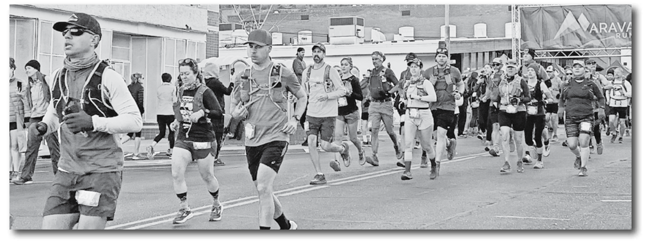
Superior played host to the Aravaipa Running Copper Corridor event Saturday. Approximately 350 runners competed in four different races: 50K, 32K, 17K and 12 K.