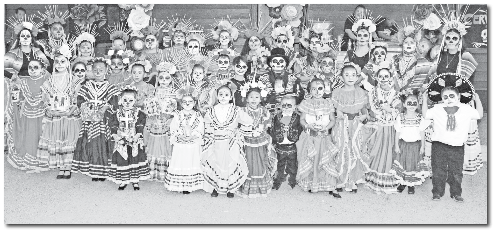
Superior Dance Company performed at the Dia de los Muertos celebration in Superior.