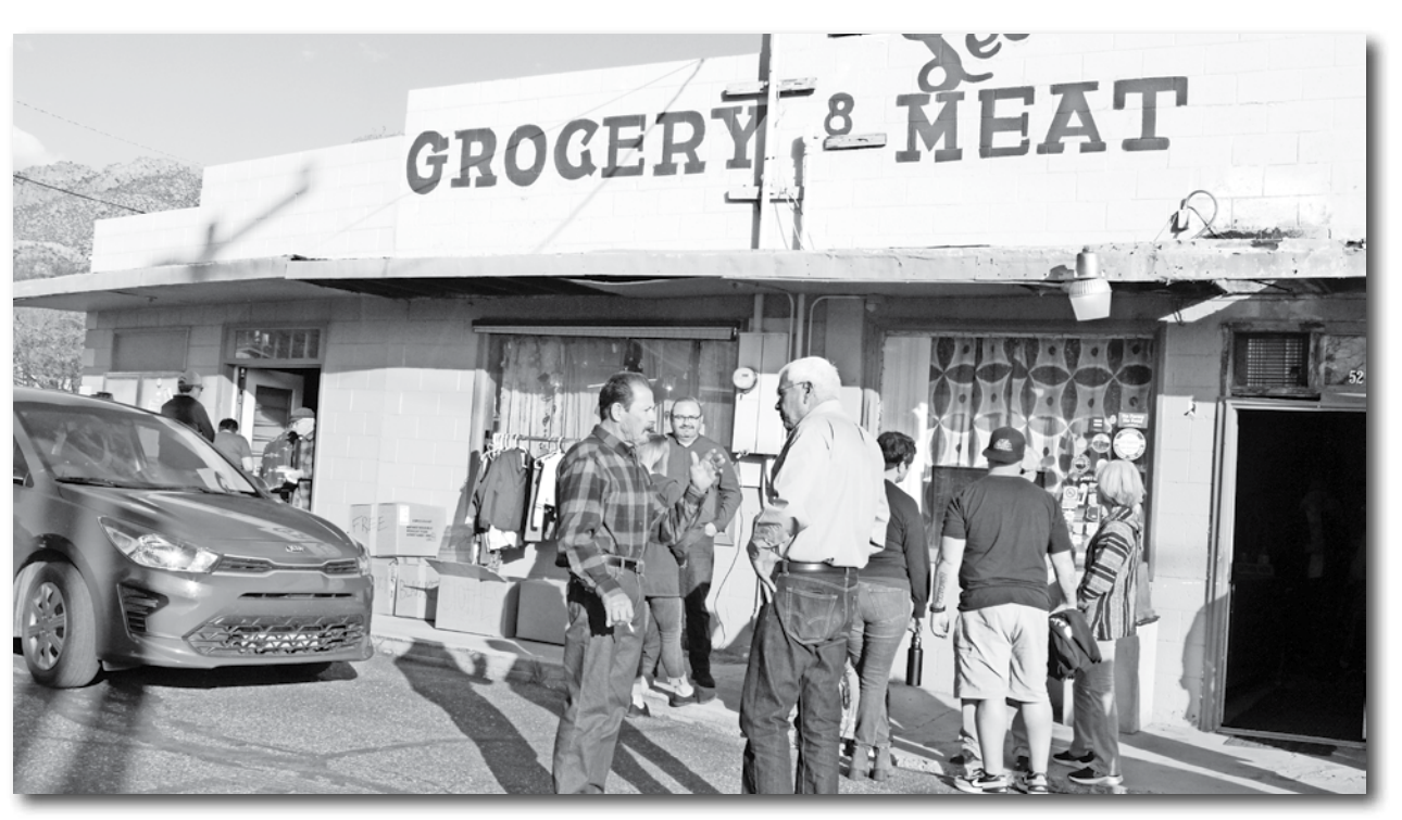
Regenerating Sonora hosted a block party last week.

Regenerating Sonora has been actively providing community activities such as movie nights and open mic sessions at the Leo's Community Development Center. They are also growing LEHR gardens to help grow more local produce in Superior.