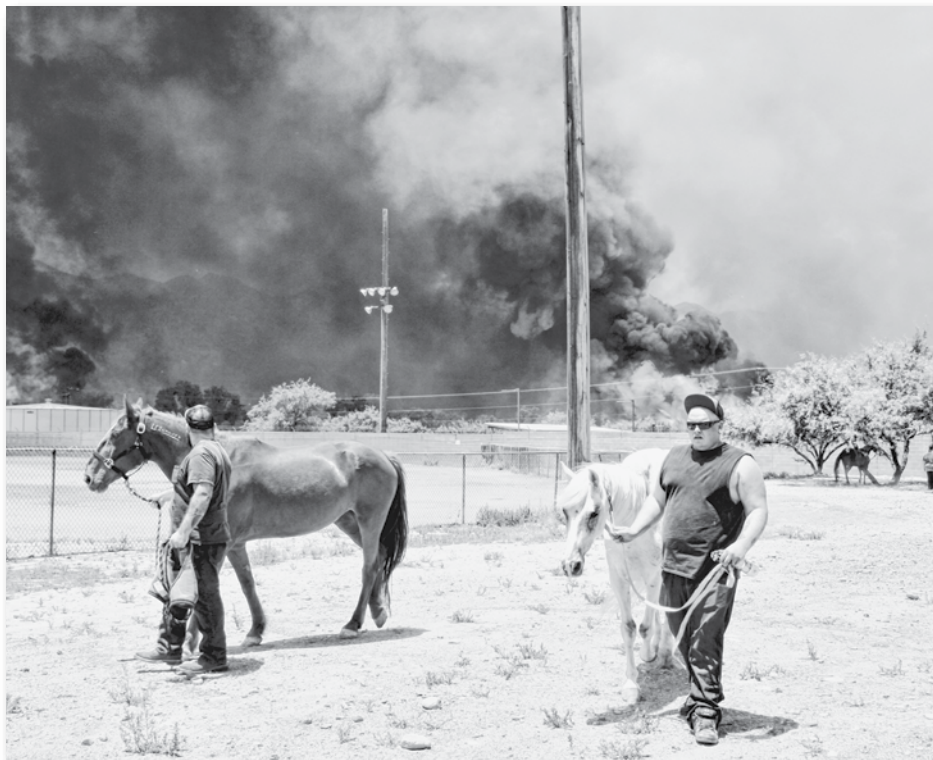
Are you prepared for a wildfire? Owners of animals have to be especially prepared in the event of an evacuation.