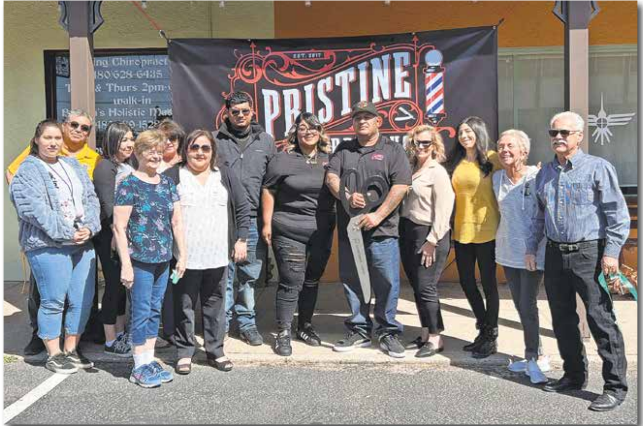
It's official – Pristine Barbershop is open.