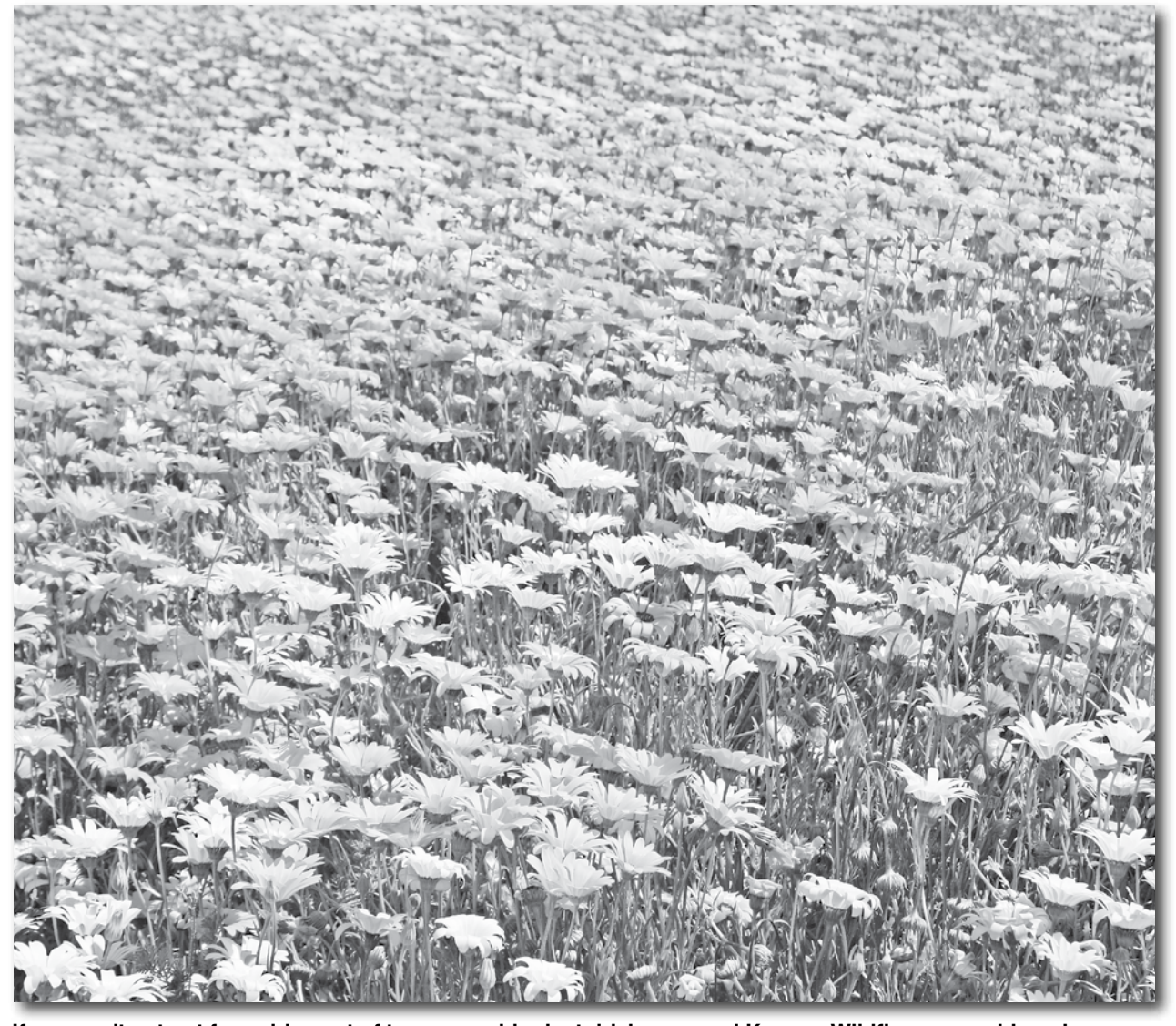
If you can't get out for a drive out of town, consider just driving around Kearny. Wildflowers are blooming everywhere. Lupines, poppies, African daisies – all sure signs of spring.