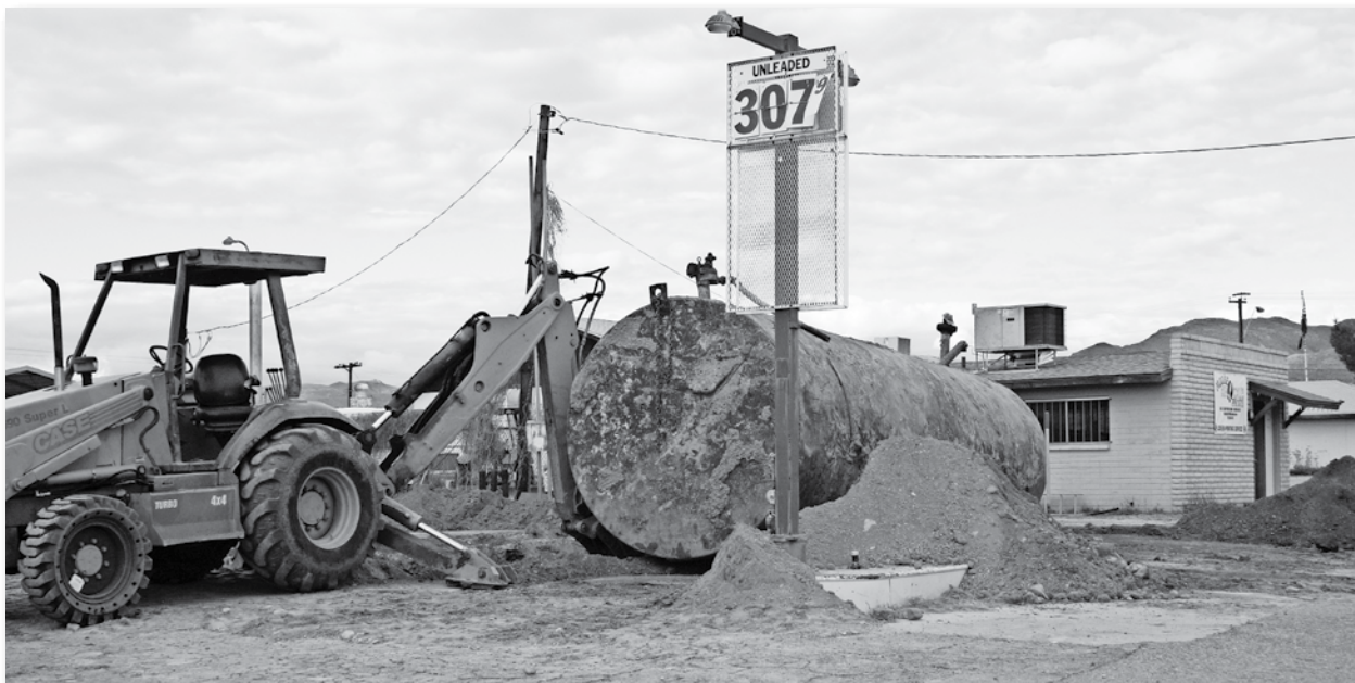
This old gasoline tank is unearthed at the former Snak Shak store in Kearny.