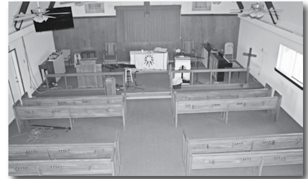
The Nomads refinished the pews at the Methodist Church.

For more information on Nomads, visit online at www.nomadsumc.org .