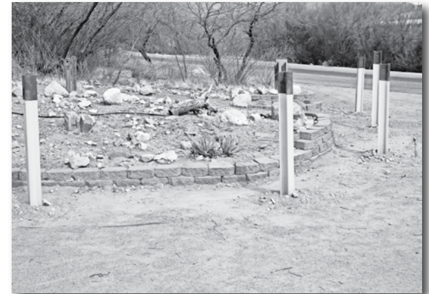
New posts resembling matchsticks were installed to keep vehicles off the landscaped area.