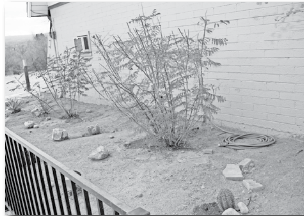
The Nomads did a lot of landscaping work at the United Methodist Church of the Good Shepherd.