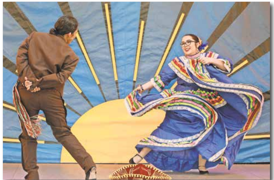
Superior Dance Company performs at the annual Ostrich Festival in Chandler.