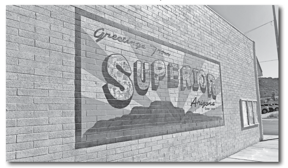
One of the many murals on Main Street in Superior.

day of exploring all that the town has to offer. For more information, contact the Superior Chamber of Commerce at 520-689-0200.