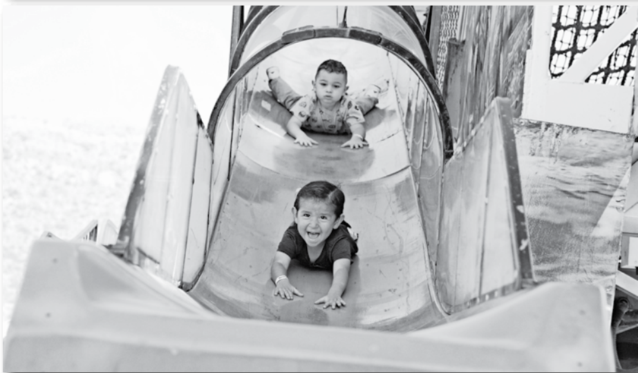
A little fun at the Apache Leap Mining Festival carnival.