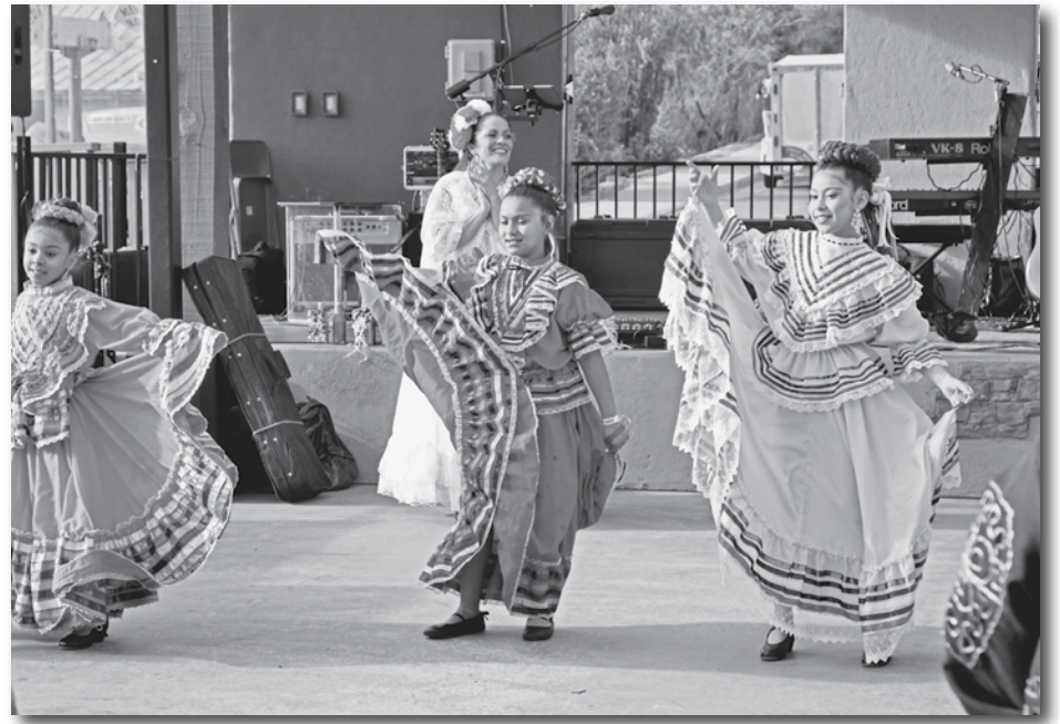
Superior Dance Company performs.