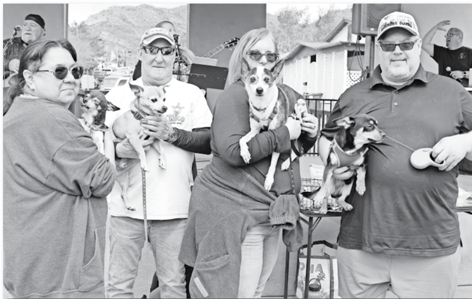
Chihuahua race winners are from left, 3rd place Baby, 4th place Taco, 1st place Phoebe and 2nd place Mookie.