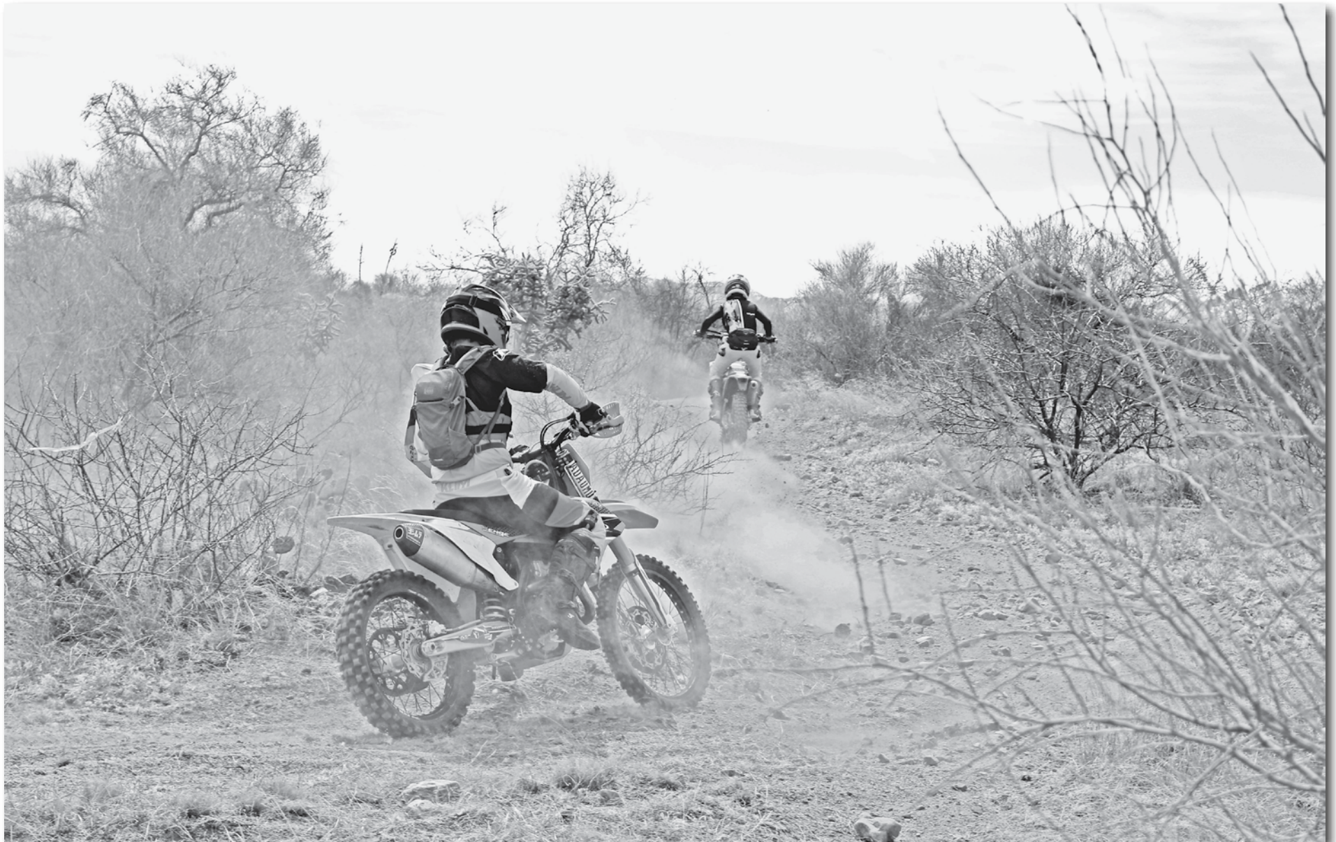
Younger riders head off into the desert on the track for the 2023 Copper Classic.