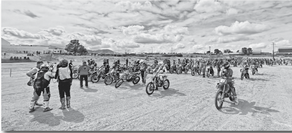
Racers await the start of the A, AA and B Class race.