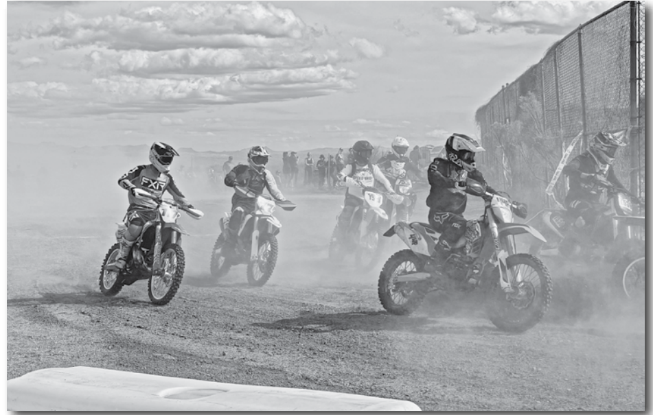
Plenty of dust was kicked up at the 17th Copper Classic.