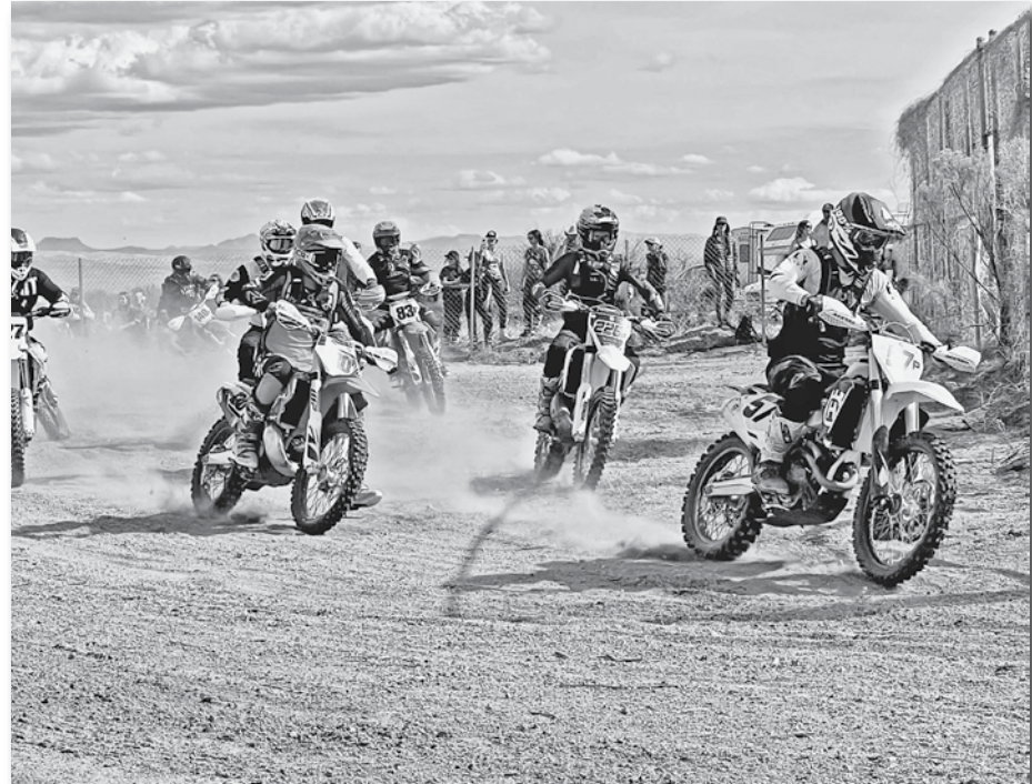
A large group of riders complete the first corner cleanly.