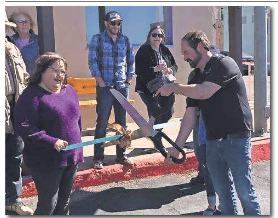
The expansion of Bruzzi Vineyard's Superior Tasting Room is official.