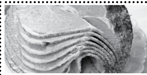
Cook's Half Hams