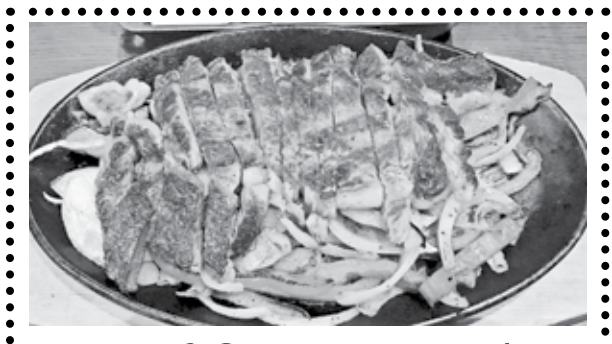
Beef Carne Asada