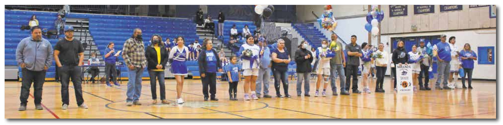
Hayden High School seniors and their parents were recognized between varsity games.

face the Lobos. The Lady 'Cats were unable to find a win, and lost 17-37. The Bearcats had a hard time against the Lobos as well, closing out the end of the night with a loss. The final score of the boys' game was 55-79.