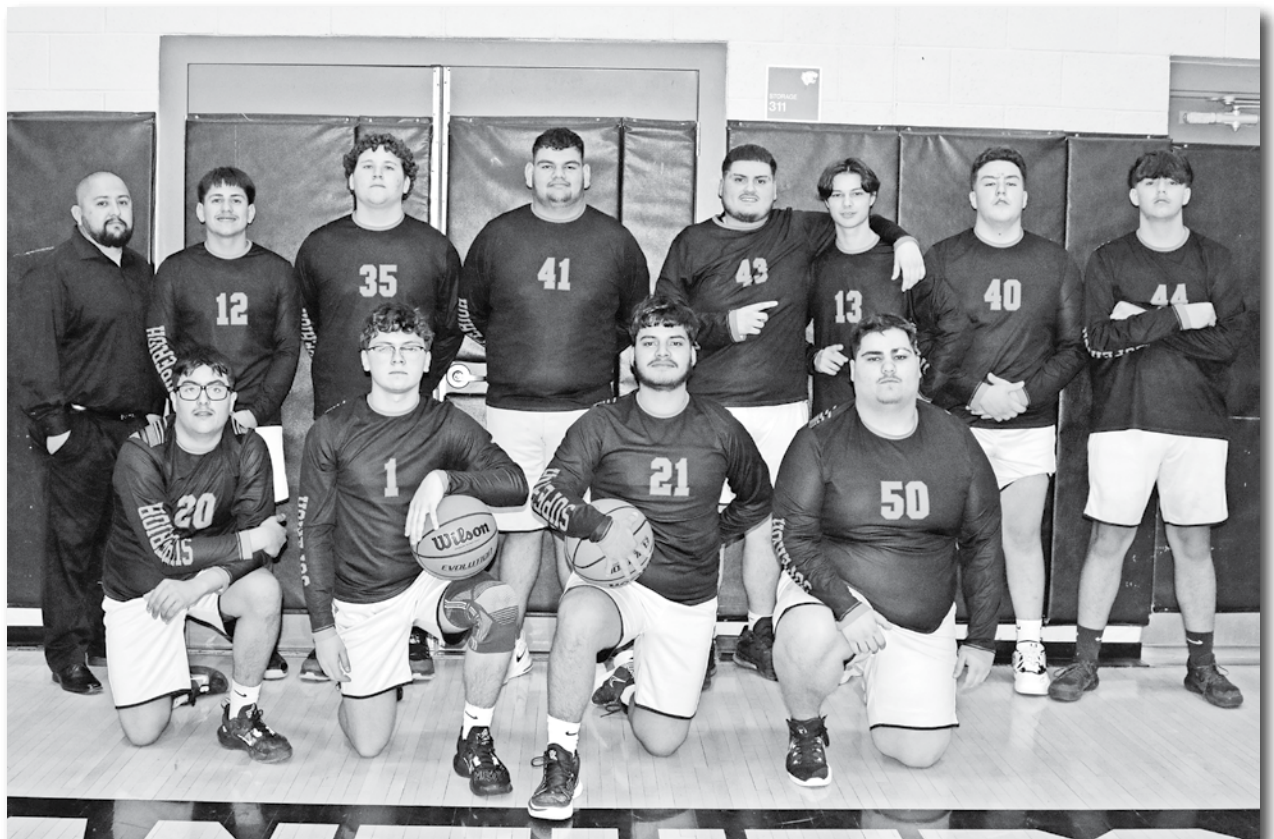
The 2022-23 Panthers.