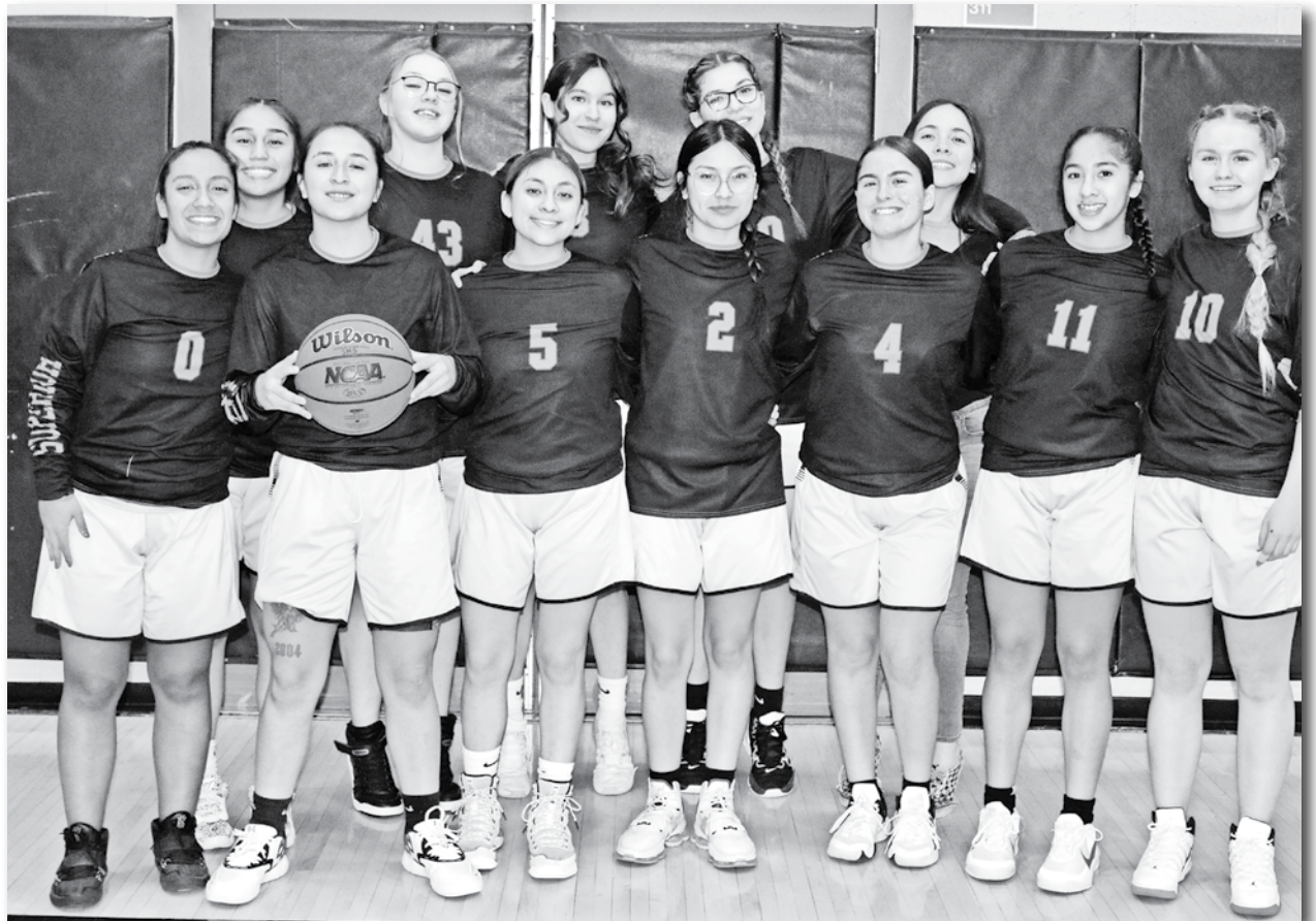
The 2022-23 Lady Panthers.

Owner of Advertising Development Services, Dewey, AZ