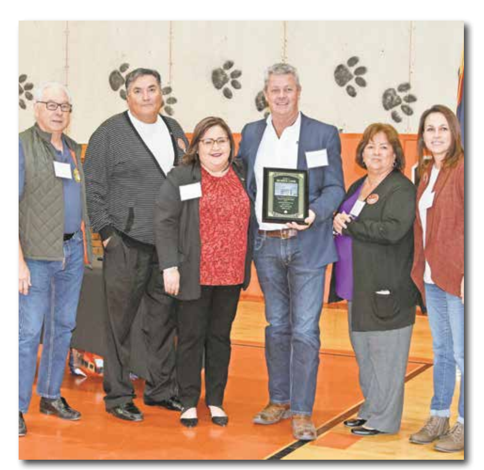
Members of the Superior Town Council recognized Resolution Copper for its help in securing the Historic Superior High School property.

Besich also shared that the plans for the complex which will include Town Hall operations, Town Library, Senior Center and the home of the Superior Enterprise Center. Following the ceremony, guests were able to tour the building. Touring the high school was also a main attraction for the Superior Home Tour over the weekend.