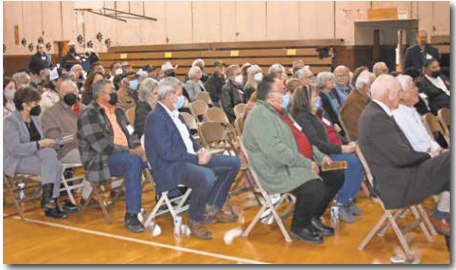
There were many residents and former students in attendance at the dedication of the Historic Superior High School property.