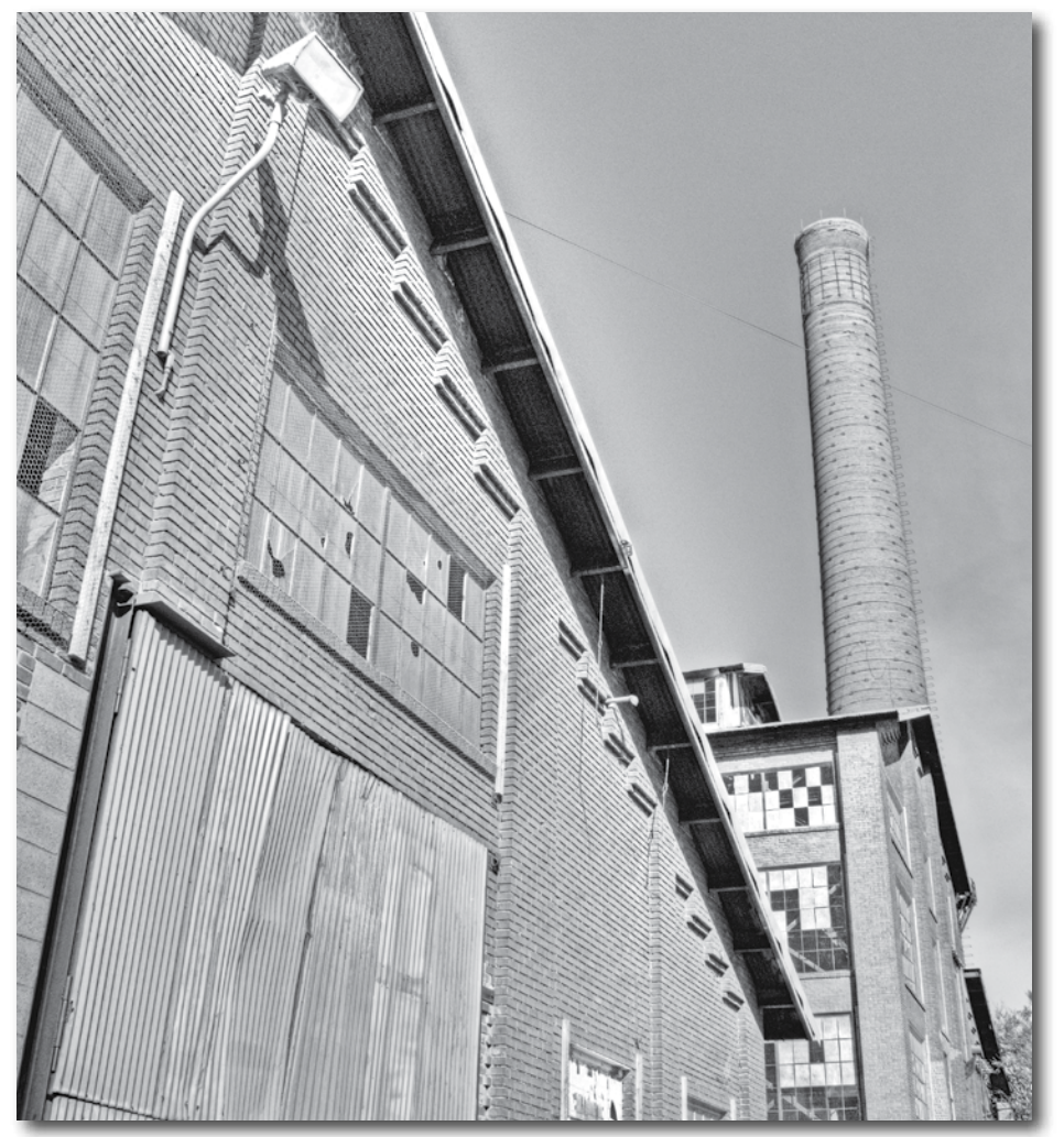
The Magma Smelter in Superior was demolished in 2018, but it represents a rich history of copper mining in the Copper Corridor.