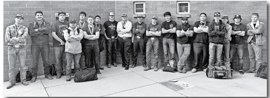
A group photo of all students participating in Region 3 SkillsUSA.