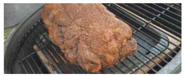
Pork Picnic Roasts Premium Swift Select • Previously Frozen 99¢/1b