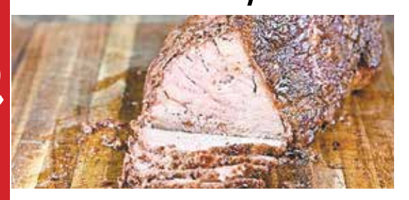
Round Rump Roast Boneless • Fresh Frozen $4.99/1b