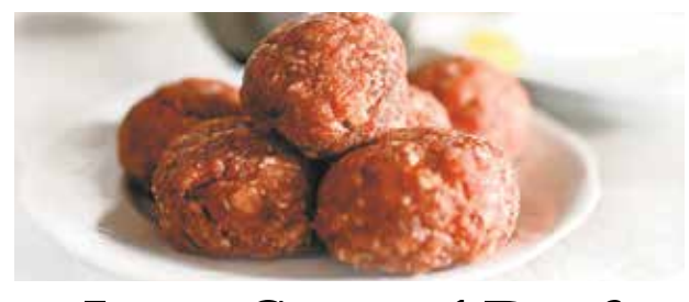
Lean Ground Beef 10-1 lb Tubes • Fresh Frozen • 85% Fat Free