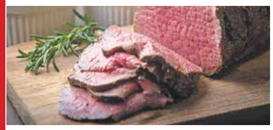
Eye Round Roast Boneless • Fresh Frozen