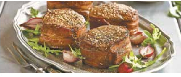
Beef Tenderloin Steaks USDA Choice Cut • Bacon-Wrapped • Seasoned