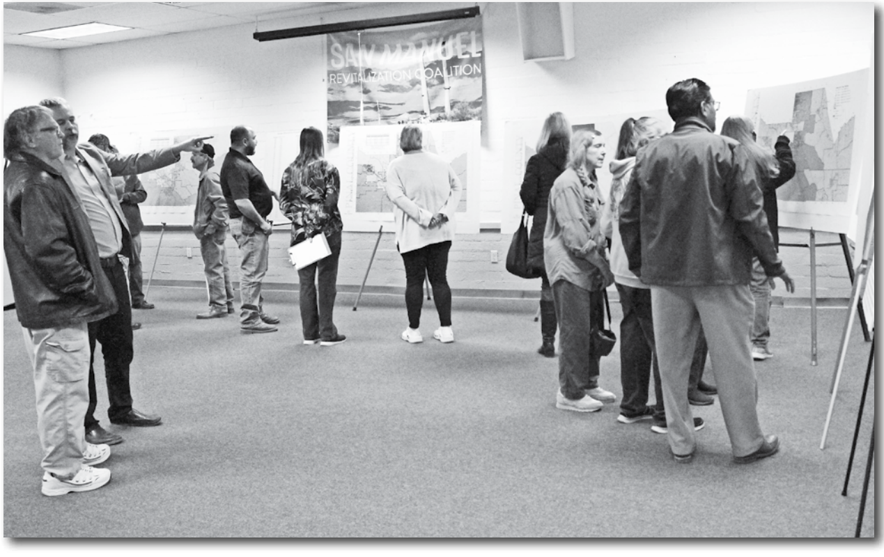
Copper Corridor residents look over the proposed redistricting maps at the open house last week in San Manuel.

The first form to file is the Candidate Statement of Interest. It can be downloaded here: https://bit.