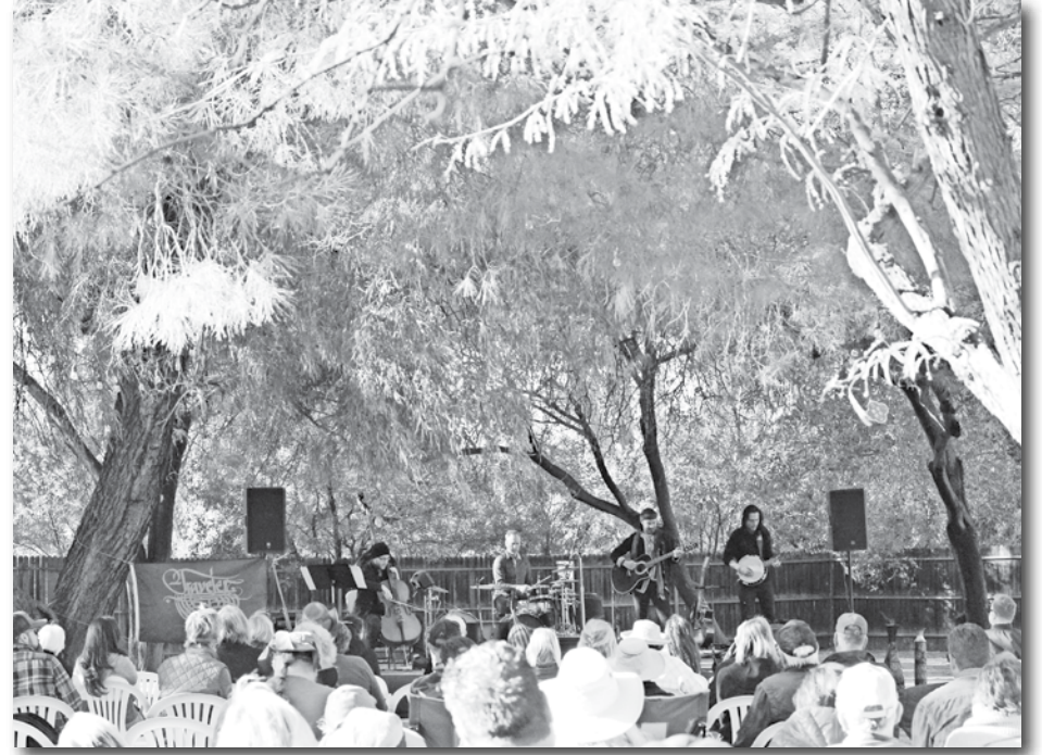
Traveler performs under the trees at the Boyce Thompson Arboretum over the weekend in celebration of the Lunar New Year.