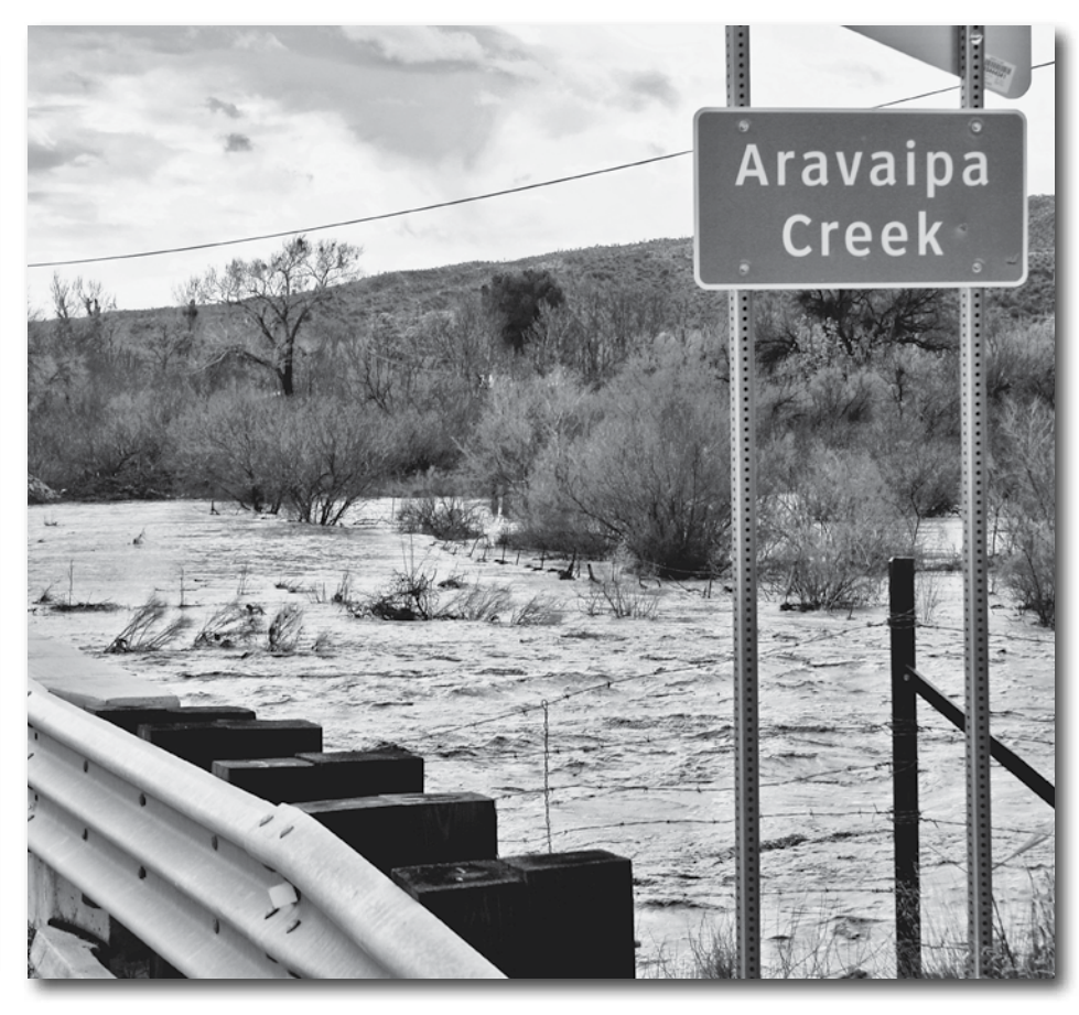
Aravaipa Creek was up and running.