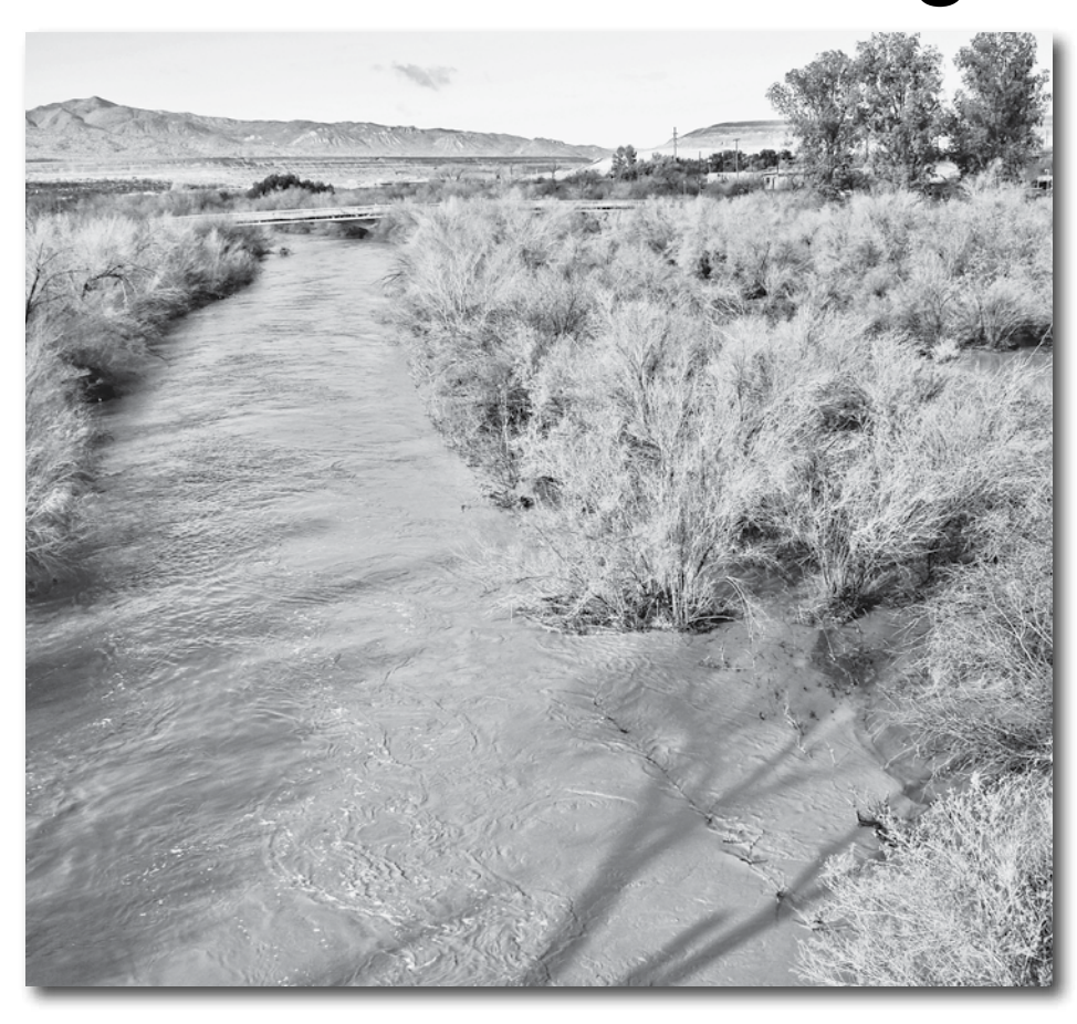
The Gila River was running out of its banks in Winkelman Tuesday morning last week.