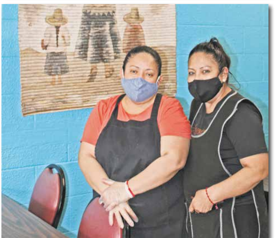
The ladies at Las Michoacanas Restaurant in Mammoth are ready to serve up some yummy food.

Just South of Mile Marker 127 on Highway 77, 40 minutes north of the Biosphere.