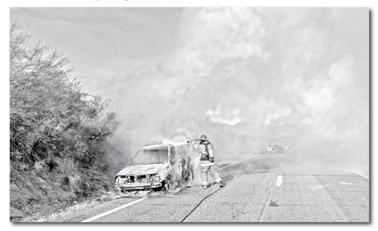
Firefighters from Pinal Rural Fire and Medical District extinguish a car fire just north of the San Manuel Junction on Highway 77. The road was closed briefly in both directions.

Pinal Rural Fire and Medical crews were assisted by the Arizona Department of Public Safety and Pinal County Sheriff's Office.