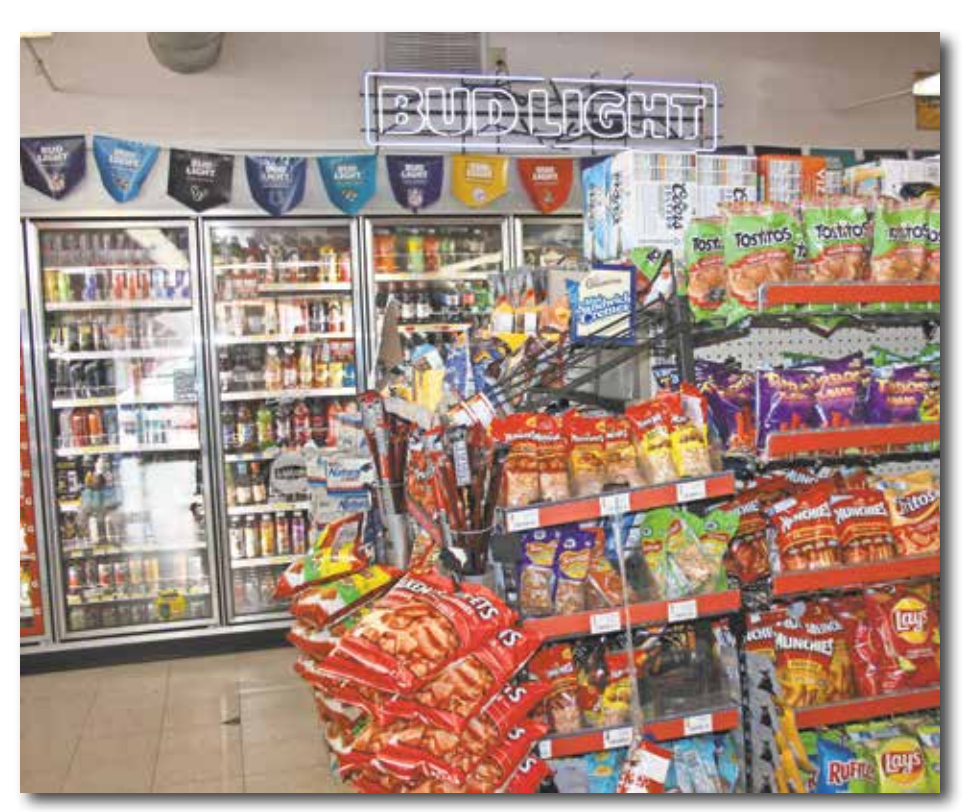
Cactus Mini Mart in Kearny features a well-stocked store.