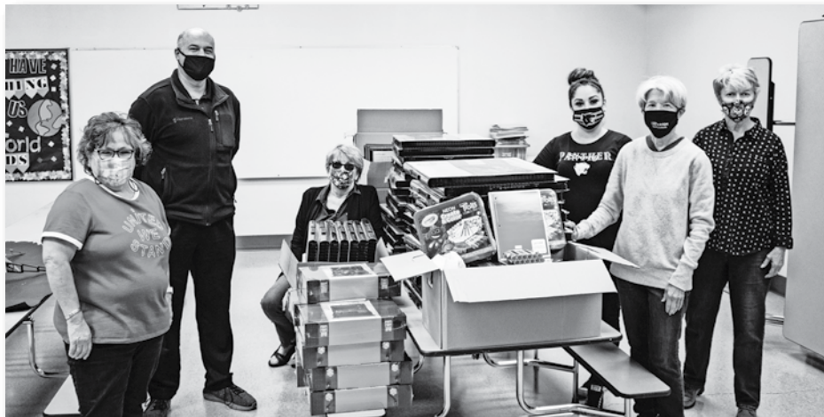
Members of the Superior Optimist Club display some of the art supplies donated by Michael's.