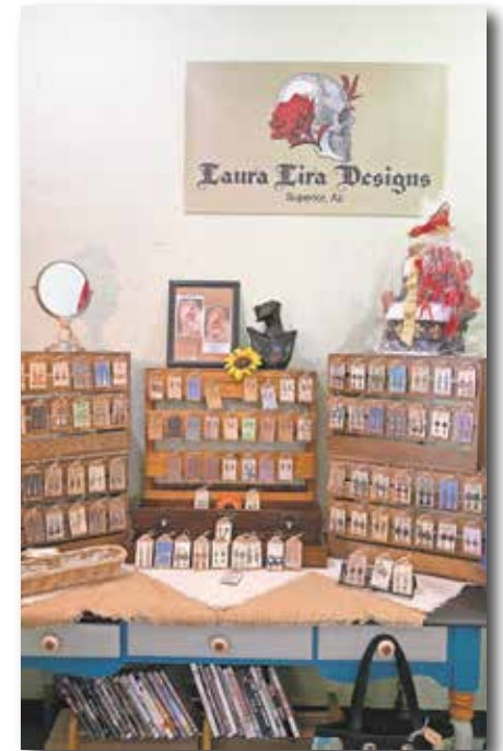
Two of the shops that are open in Willa Ficarra's Sun Flour Market & Cafe.