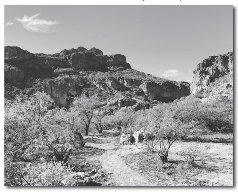
One of the picturesque scenes on the LOST.

members and all of their activities online at www.superioraztrails.com. Their 2022 Hashbrowns, History and Hiking series will begin in February.