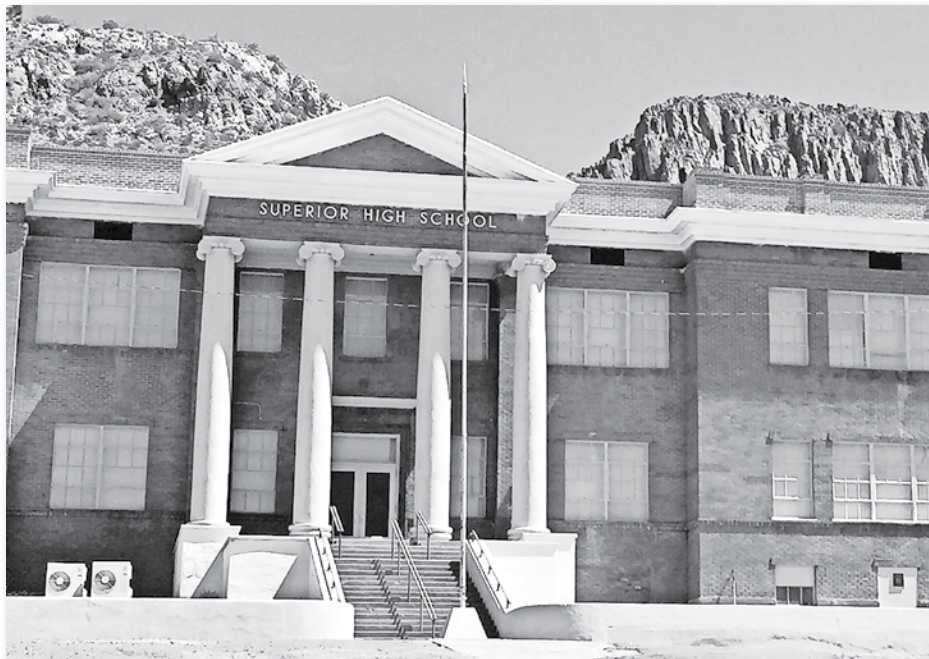
The historic Superior High School was purchased by the Town of Superior and will become the new multi-gen center.

While this is a brief highlight of 2022 in Superior, everyone at Copper Area News - Superior Sun wishes you a Happy New Year. We look forward to covering the news of 2023!