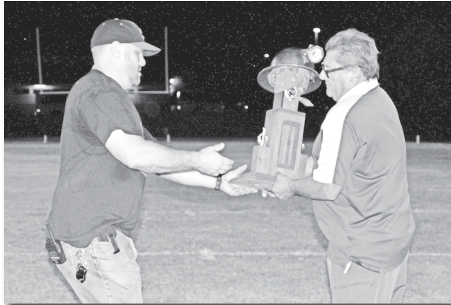
The Copper Helmet is returned to Superior after the Panthers beat the Bearcats during the annual game.

At the Superior Sun , we continued to follow all of the community activities while still focusing on showcasing many local businesses and organizations. 2022