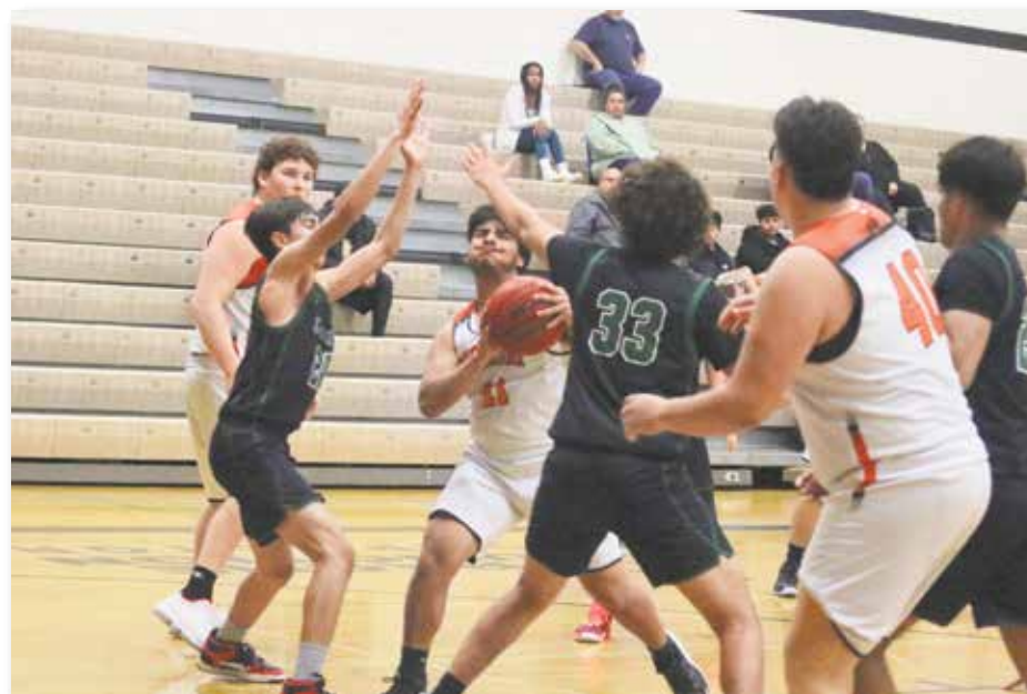
The Panthers compete against the Prospectors and the Trojans at the Lost Dutchman tournament in Apache Junction.