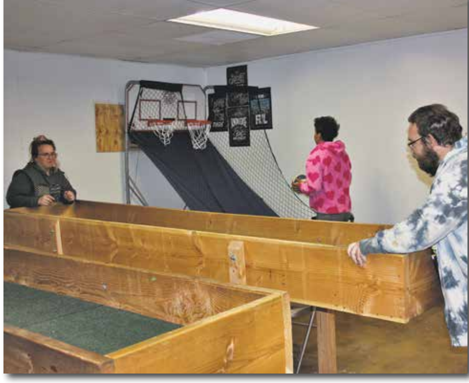
Friday was a cold day in Kearny. The Kearny Library Activity Center provided fun activities in a warm place.