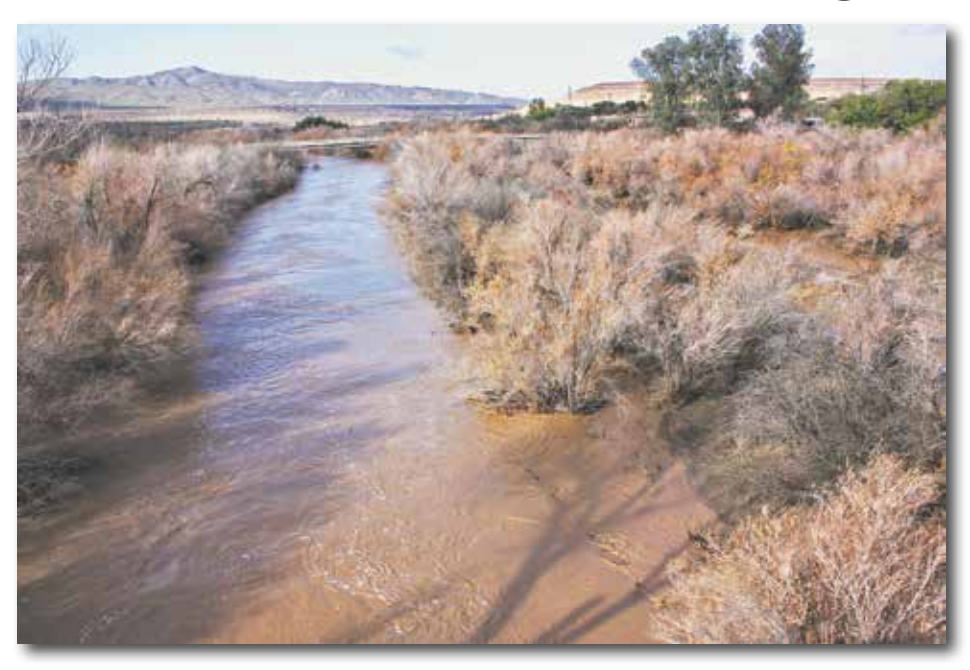
The Gila River was running out of its banks in Winkelman Tuesday morning last week.