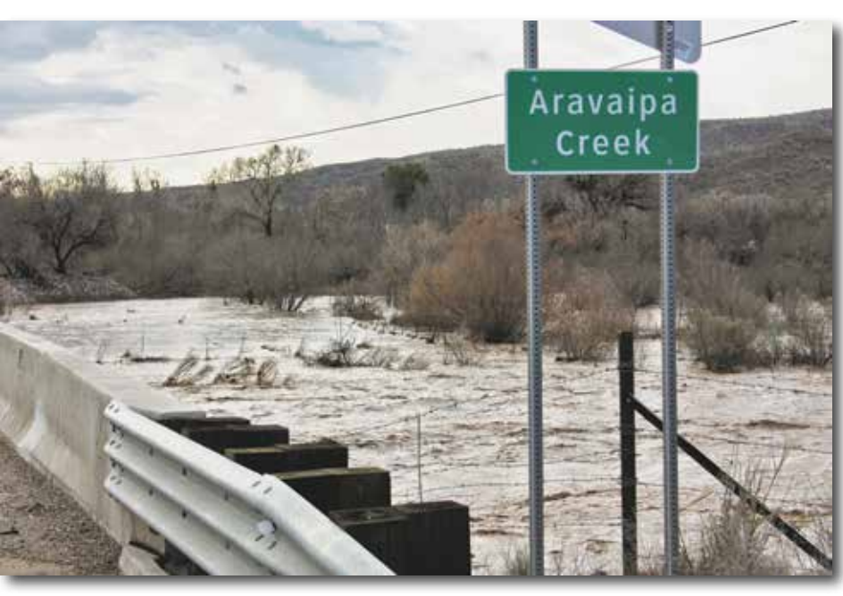
Aravaipa Creek was up and running.