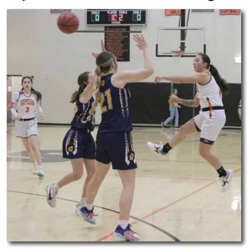
Superior hosted Joseph City this past weekend.

The Panthers and Lady Panthers will see Fort Thomas early in the week. Both teams will then host Dishchii'bikoh on Jan. 13, with a start time of 5:30 p.m.